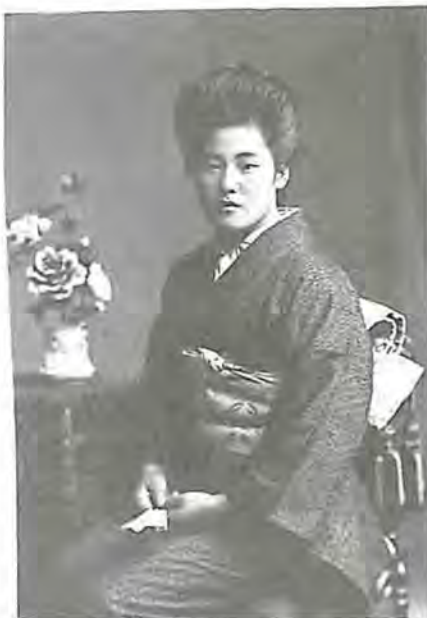
11, 12. Below left and right: Photograph of a Japanese "Picture Bride" and her prospective husband from a 1915 San Francisco INS Arrival Investigation case file.