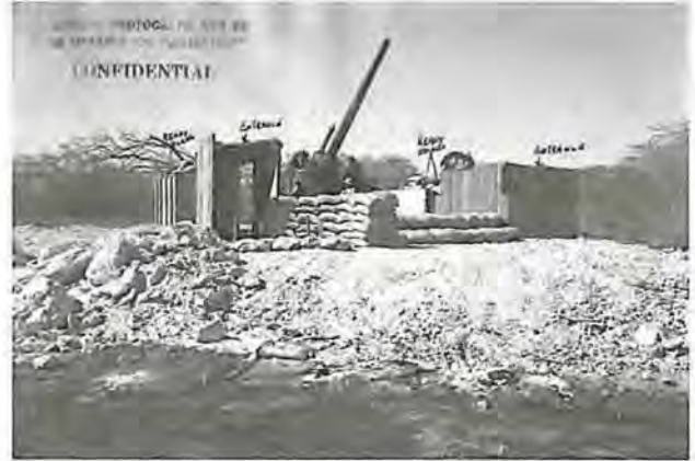
22. (left) Taxation map of Maui, 1943, showing lands leased by the U.S. Navy. 23. (above) Photo of Ewa beach and artillery emplacement, Oahu, Hawaiian Islands, ca. 1942. 24. (below) Map of Lele, Kusaie (now Kosrae), eastern Caroline Islands, originally drawn by an expedition sponsored by the Hamburg Ethnological Museum, 1908-1910.