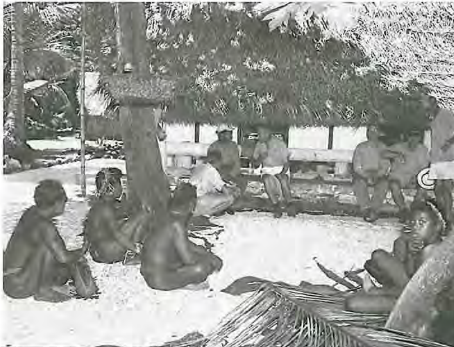
20. Admiral DeWitt Ramsey confers with indigenous island representatives at an unspecified Trust Territory location, ca 1946. Ramsey was the second High Commissioner of the Trust Territory of the Pacific Islands, serving April 17, 1948 to May 1, 1949.

Records of the Island Trading Company of Micronesia, Government of the Trust Territory of the Pacific Islands, 1947-54. The company was incorporated as the successor of the U.S. Commercial Company in 1947 to promote the economic advancement and self-sufficiency of residents. It administered the import and export trade of the Trust Territory and Guam from its headquarters in Guam and later in Hawaii. The records relate to company finances, operations, organization, and projects. Included is a report of the 1946 naval inspection of the Caroline Islands, with information about commerce, education, health, industry, population, religion, sanitation, and the operations of the U.S. Commercial Company. The records consist of issuances, minutes, and reports, 1947-1954. Nontextual records consist of photographs interfiled with textual records.