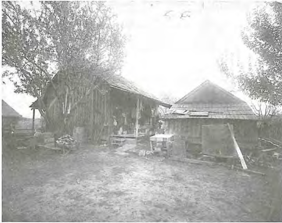
27, 28. (above and below) Outside and inside views of the Ah Co and Company store in Suisun Valley. During the Chinese Exclusion Era, Chinese merchants in the U.S. were required to provide proof of their status. Immigration officials investigated many Chinese businesses to ensure that each was "genuine mercantile firm with no prohibited features," and that members of the firm engaged in "no manual labor other than that necessary to the conduct of the said business." The INS considered businessmen who were not engaged in selling merchandise in a store to be laborers. This included photographers, doctors, restaurant owners, craftsmen, and many other professions.