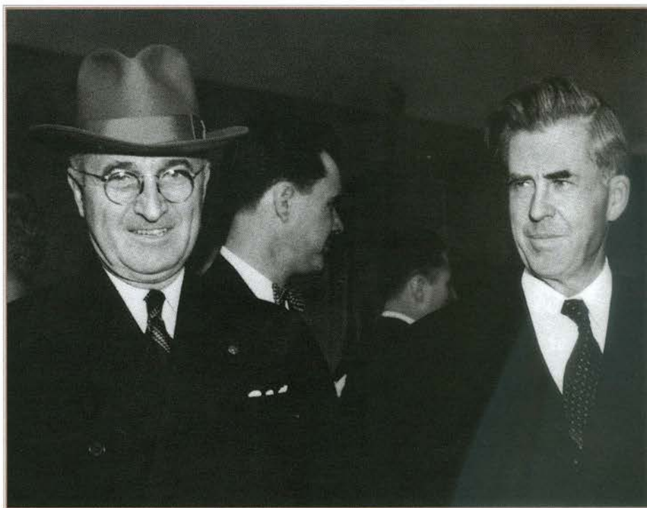
Henry Wallace (shown with President Truman) demonstrated the popular susceptibility to fears of conspiracy of the early 1950s when he telephoned presidential adviser Joseph E. Davies in January 1950. Wallace was wary of “a possible military dictatorship” in Washington.

McCarthy was neither the sole Republican to garland Lincoln Day with partisan oratory nor the only one to raise the Communist issue, which had already gained prominence in American political discourse. However, his charges were the most melodramatic and specific (though he later waffled on what he had said in Wheeling). They led to a Senate subcommittee investigation of his rapidly shifting accusations and launched five years of political turmoil, during which the junior senator from Wisconsin was seldom out of the headlines. This article treats the circumstances of McCarthy’s seizure of the Communist issue, a topic that interested his critics at the time, the journalists who had to follow and explain his oft-mutating charges, and those seeking to understand his tempestuous career. It was these early months of 1950 that launched what came to be known as