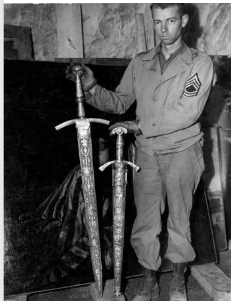
This Prussian crown was part of a collection of coronation paraphernalia found at Bernterode. Below: Two finely wrought swords of Frederick the Great.

were repacked and deposited in the bank. The boxes contained, among other objects, the Prussian coronation paraphernalia.