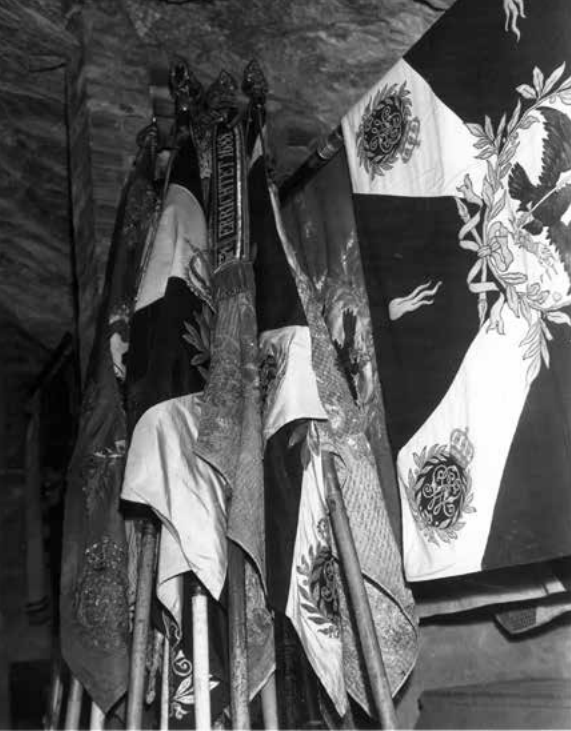
More than 200 German regimental flags, dating from both the early Prussian wars and the World War I era, were hung above the coffins.

shrine marking the supposed resting place of St. Elizabeth, a Hohenzollern ancestor. The north transept, cut off from the choir, nave, and crossing by screens and metal gates, could thus be kept closed to public view without arousing curiosity or impairing the fabric of the building.