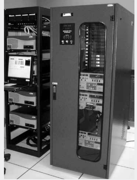
Above: The SAMMA automated robot systematically digitizes 44 ¾-inch U-matic videotapes at a time. Left: Audrey Amidon, motion picture preservation specialist, inspects 35mm film to prepare for preservation and access of moving image collections.

events in the 1960s and early 1990s. The films have been printed and reprinted over the decades, and any surviving nitrate material was reformatted after a 1978 fire in the nitrate vaults. Most of the preservation and master elements are now on polyester film stock, with only the Durborough Collection surviving on nitrate deposited with the Library of Congress.