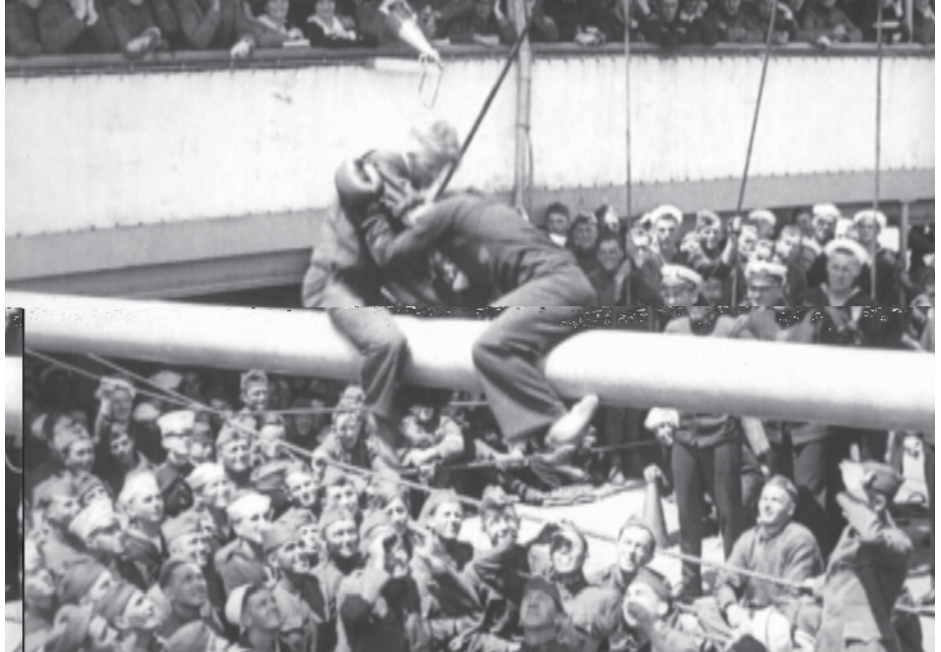
Above: A boxing competition is staged for President and Mrs. Wilson aboard the USS George Washington on July 8, 1919. Below: Training activities at Fort Lewis, Washington.