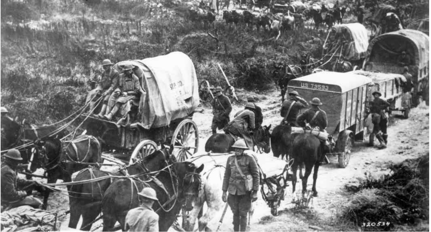
U.S. forces march forward during the Argonne offensive sometime between September and November 1918.

they boarded a ship and sailed for France. This was a time of camaraderie and forming friendships that would become invaluable once the boys were in the midst of the war.