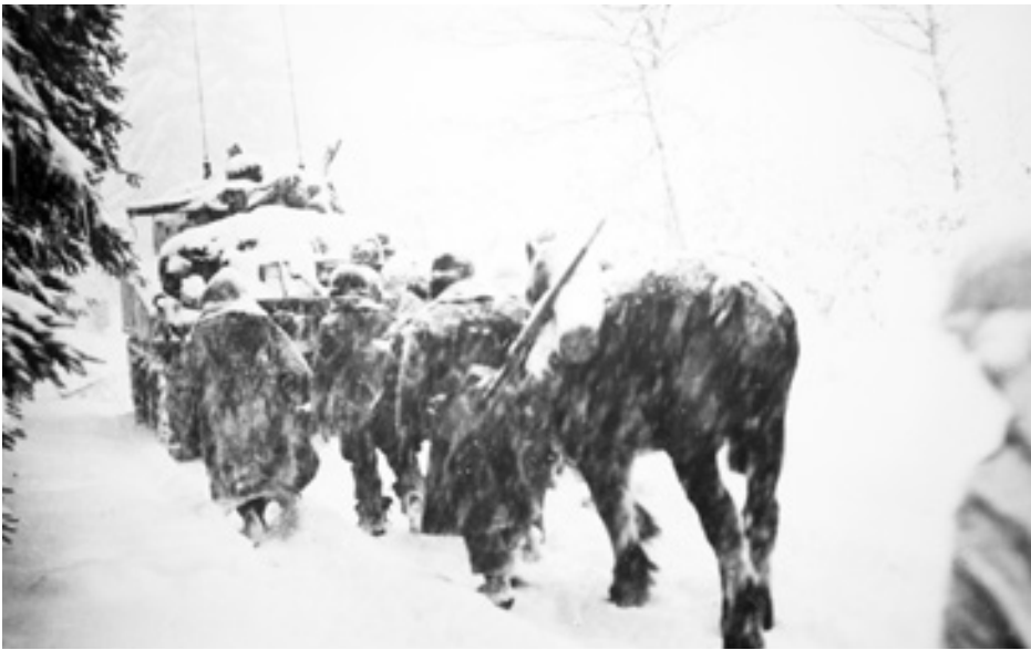
Above: U.S. troops march behind tanks somewhere in the Ardennes. Below: An American soldier holds his rifle on German prisoners taken in the "Bulge."

By December 1944, the Allies had pushed inland from the French coast to the German lines. They were ready to cross into German territory and move toward Berlin to deliver the final blow to Hitler's Third Reich.