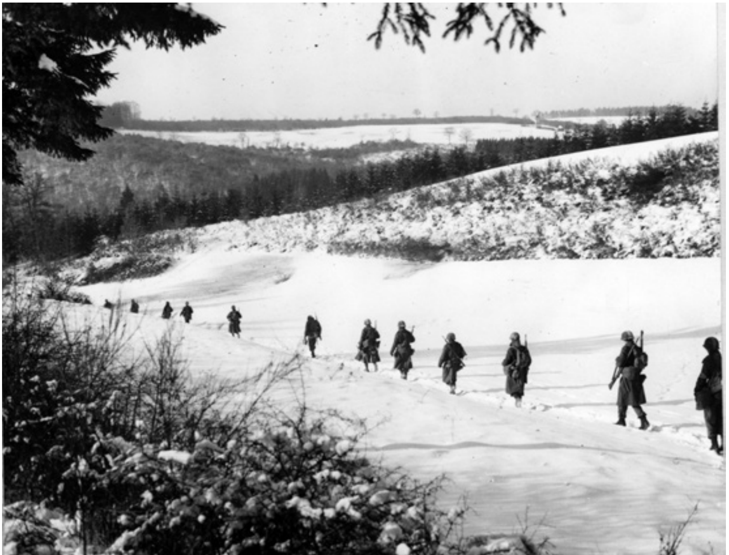
The 26th Division Engineers return to their normal assignments after a brief tour of duty as infantry, January 15, 1945.

The fighting would continue for another month, but Hitler’s last chance at stopping the Allies advancing from the west was lost.