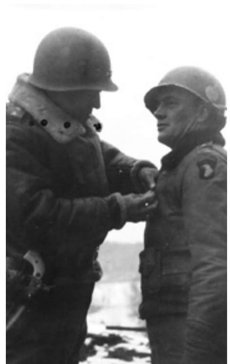
Left: Brig. Gen. Anthony C. McAuliffe relayed to his troops his response of "NUTS!" to the German demand for surrender, stating that "[B]y holding Bastogne we assure the success of the Allied armies."