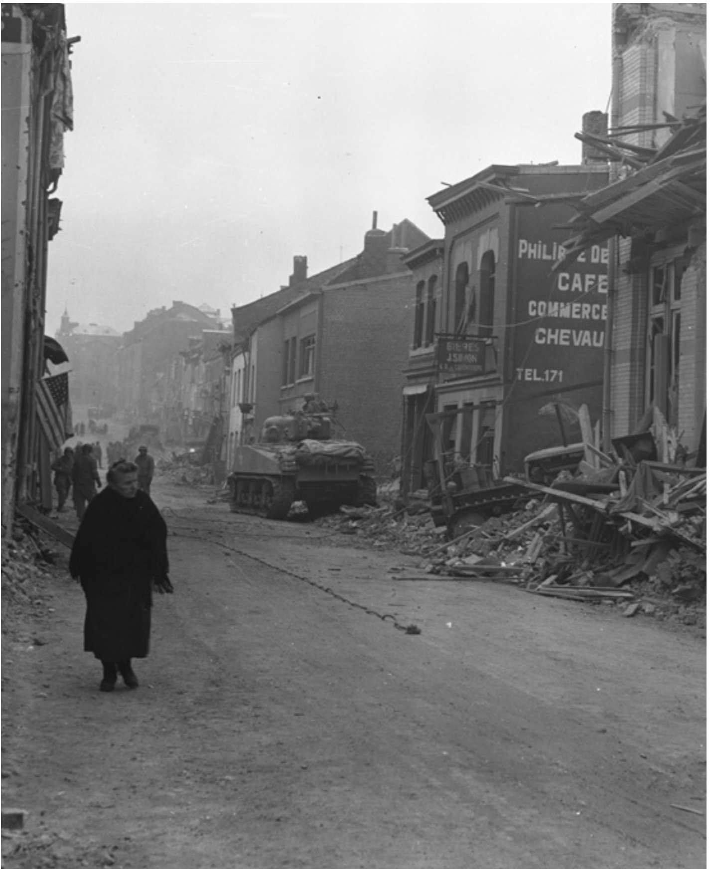
Bomb damage, the result of a 10-day siege of the 101st Airborne Division in Bastogne, Belgium, December 26.