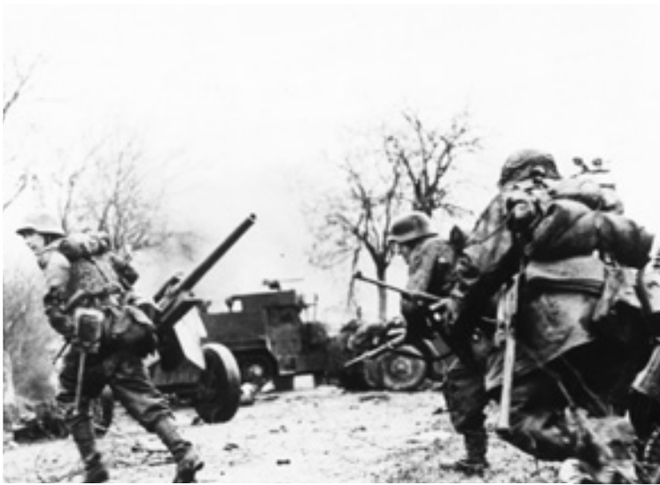
Above: German infantrymen run across a Belgian road strewn with Allied armor and artillery. Left: The German advance along American lines in Belgium's Ardenne Forest in December 1944 created a dangerous "bulge," as shown in this Army map.