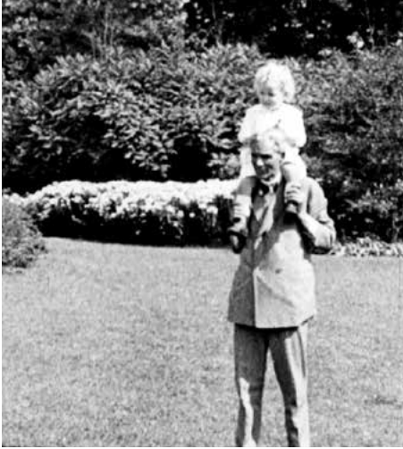
Henry Ford plays with his 3-year-old grandson Henry Ford II, from Henry Ford and Grandsons , 1920.

In the garden at Fair Lane, Henry Ford carries Henry Ford II on his shoulders as Mrs. Ford stands alongside; Ford II enters and leaves the summer pavilion at Fair Lane; Ford II chases chickens in the chicken pen; Ford sits in the garden and plays with Ford II; Ford carries Ford II on his shoulders; . . . Ford II chases cows in a pasture; Ford and Henry Ford II on a swing; . . . Benson Ford sits on a table in the garden as Ford plays with him.