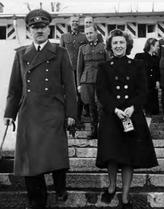
Left: Adolf Hitler and Eva Braun, ca. 1942. Right: A plan of Hitler’s underground bunker near the Reich Chancellery in Berlin, Germany, shows Hitler’s study (A), anteroom (B), bedroom (C), and “map room” (D). Adapted from a plan of the bunker in Hugh Trevor-Roper’s The Last Days of Hitler (6th ed., 1992).