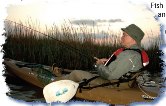
One of the Foundation's goals is to increase life-jacket wear among hunters and anglers.