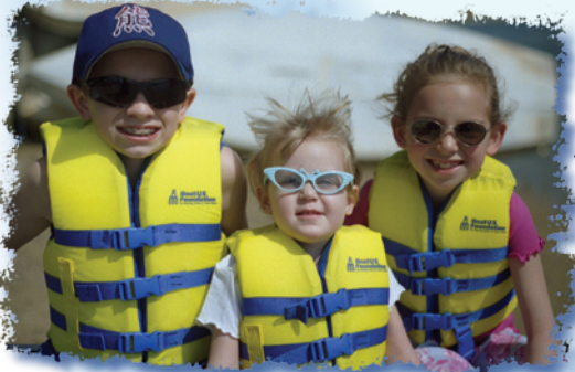
The Life Jacket Loaner program provides children's life jackets in three different sizes (above) A volunteer is being "rescued" during the Crew Overboard Symposium (right)