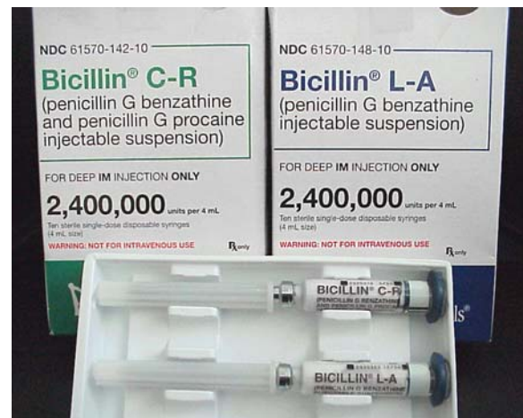
FIGURE. Labeling of Bicillin® C-R and Bicillin® L-A products before changes implemented in 2004