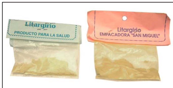
FIGURE. Packages of litargirio, a yellow or peach-colored powder, used as an antiperspirant/deodorant and a folk remedy in the Hispanic community