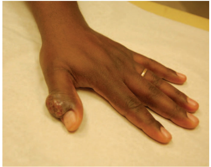
FIGURE 3. Lesion caused by orf virus infection after cutting thumb with a knife while slaughtering a lamb as part of festivities — Massachusetts, 2011

fluid, but no pus. A diagnosis of orf was suggested by an infectious disease consultant, and swabs of the crust were sent to CDC for parapoxvirus testing. Specimens were positive for orf virus DNA by qPCR. Several weeks after the initial evaluation, the woman was examined by a state public health officer who noted that the lesion was healing without signs of infection.