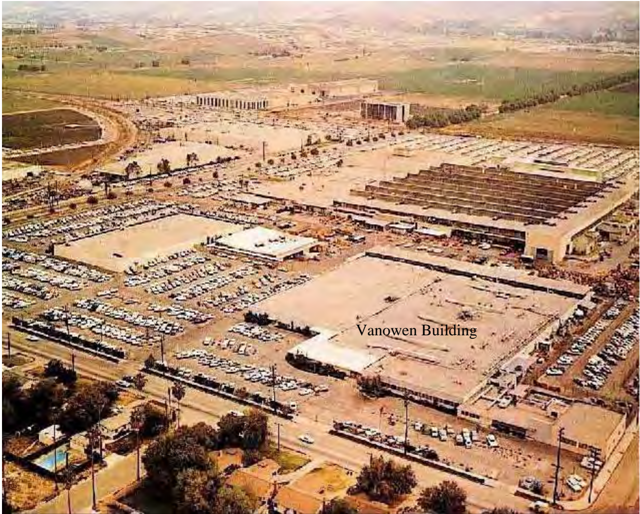
Figure 5-1: The Canoga Park Facility in 1960