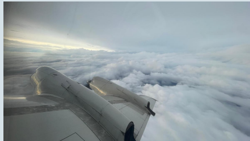
Flight through Tropical Storm Idalia on NOAA WP-3D Orion N43RF Miss Piggy on August 28, 2023.

The 2024 hurricane season has already made a significant impact on the nation. PSL has been lending its instrumentation expertise to the hurricane monitoring efforts, as well as contributing to the next generation of the hurricane forecast model.