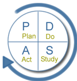
Figure 1. PDSA Model