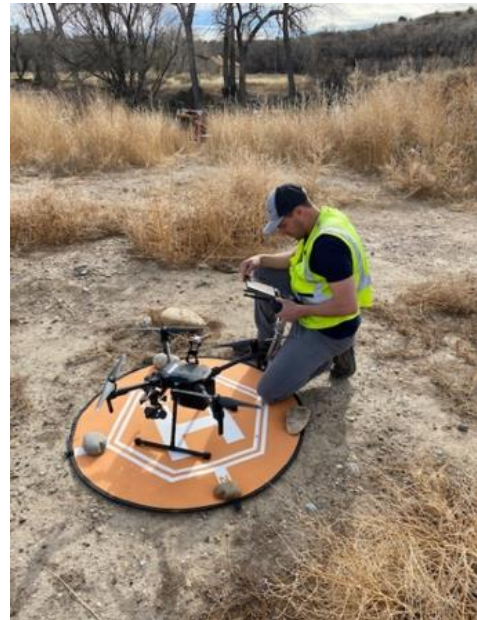
Figure 8 - Luke Javernick of River Science surveying and preparing drone

Tasks 1 (Land Survey and Certified Elevations) and 2 (Aerial Imagery Acquisition) were scheduled to begin in mid-November as soon as most leaves were off woody vegetation and trees but was delayed two months as it took four months to obtain a Special Use Permit to fly the drone over Bureau of Reclamation property within the project area. Once the Special Use Permit was granted, access within the property was coordinated through Pueblo State Park and the initial surveying and aerial imagery acquisition (1300+ photos) were completed during the week of January 17, 2022.