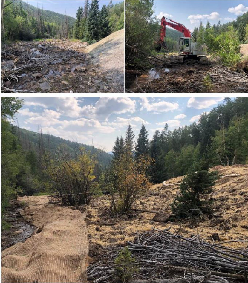
Figure 5 - Upper left showing Rawley Gulch at toe of RG3 pile and during conditions. Upper right showing excavator beginning 200 feet of stream channel construction to route water away from RG3 mine waste pile. After conditions are represented by the bottom-cent

and revegetating the consolidated waste pile, and 5) realigning 100 feet of Rawley Gulch stream channel using a combination of rock structures, locally sourced logs, and woody material.