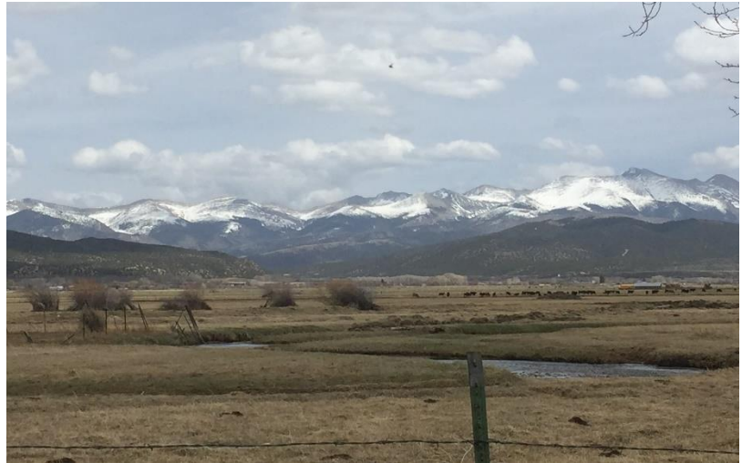
Figure 3 - Photo - Valdez Ranch, Upper Culebra Watershed

The Upper Culebra Watershed Assessment is a stakeholder driven watershed assessment that encompasses the Upper Culebra Basin. While stakeholders recognized the need to implement projects to address watershed wide concerns, they realized that current condition of the Upper Culebra Watershed was largely undocumented. This understanding prompted the Costilla County Conservancy District in partnership with other organizations including the Land Rights Council, the Sangre de Cristo Acequia Association, Herederos, Colorado Parks and Wildlife and Natural Resources Conservation Service to form a Technical Advisory Team to assist a hired contractor with project activities and prioritizing recommended projects for implementation.