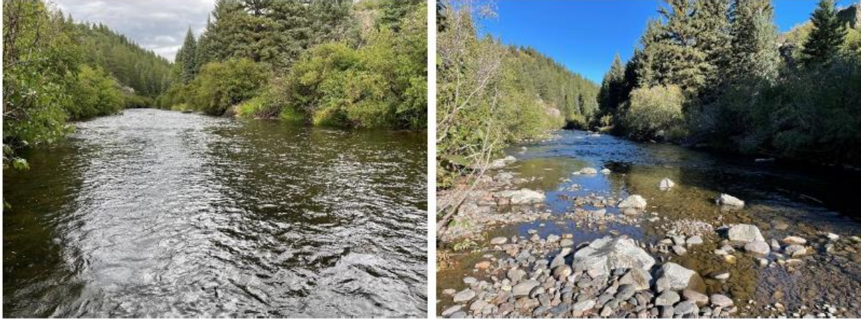
Figure 2 - Station #34+80: Looking downstream from river left. Bearing: 330 degrees NW. Left Photo Pre-construction, Right Photo Post-construction