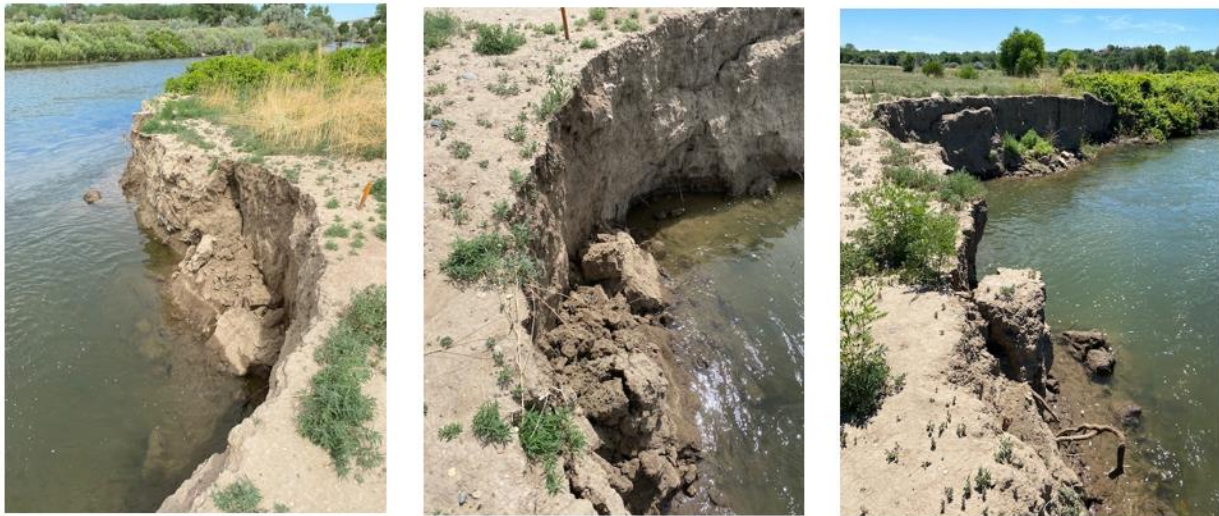
Figure 9 - Recent erosion between stations 9 and 7

TU presented this preliminary iterative design to CPW and AGRA. 3-Rocks and AGRA engineers are discussing several issues. AGRA is concerned this may not solve the issue and we are waiting to hear back from CPW what their review process is. Once in agreement, the proposed stabilization designs will be tested for shear stresses and results presented to stakeholders for review and approval. A contract extension was granted in July 2022.