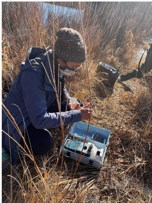
Figure 7 - Groundwork Denver Water Quality Monitoring

and construction designs to support funding requests for a major stream and wetland restoration project.