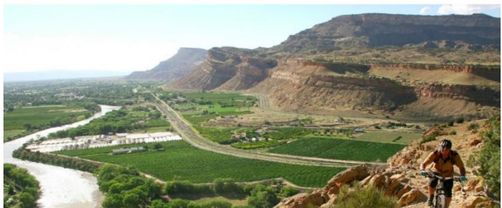
Figure 4 - Grand Valley River photo