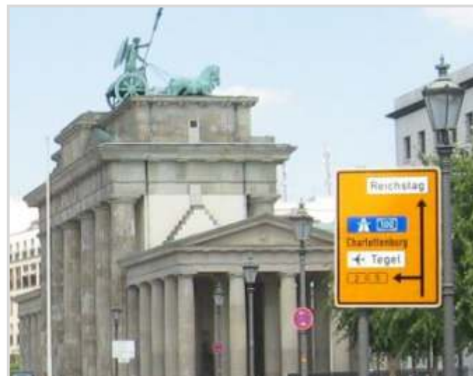
Signpost next to the Brandenburger Tor