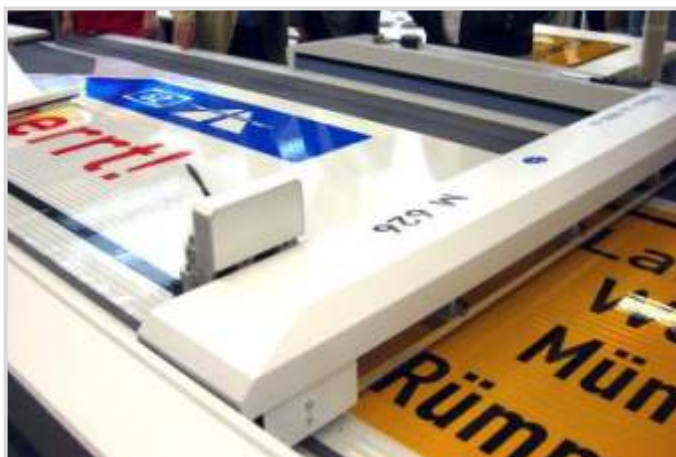
Manufacturing of a traffic sign on a special printing machine