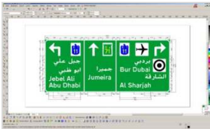
Computer-aided draft of a land-use plan for road signage in Dubai

"Using CorelDRAW's application controllers, we've always been able to develop special functions and tailor solutions to customers' exact needs," he says. The firm's already done that for well over 3,500 users in Germany alone. Dr. Haller is especially proud of the feature that he and his team integrated into CorelDRAW two years ago, which has been available ever since. "When users position their cursor over an object, they see a choice of functions, like turn, straighten etc.. It helps them get their work done five times faster!"