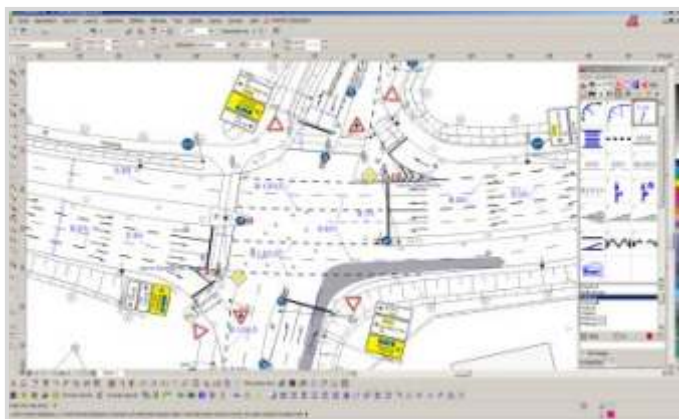
Screenshot of a map displaying traffic markings. It shows a crossing in Sachsen-Anhalt