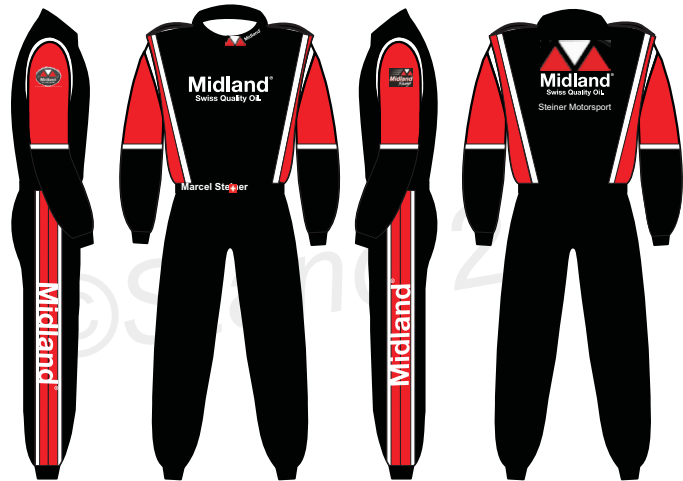
Racing Suite Design, Marcel Steiner