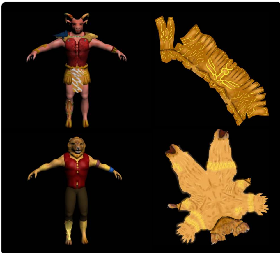
Making the most of CorelDRAW Graphics Suite - creating the textures on the final character models

Only limited by their imagination. The team designed logos, t-shirts and business cards to promote their game