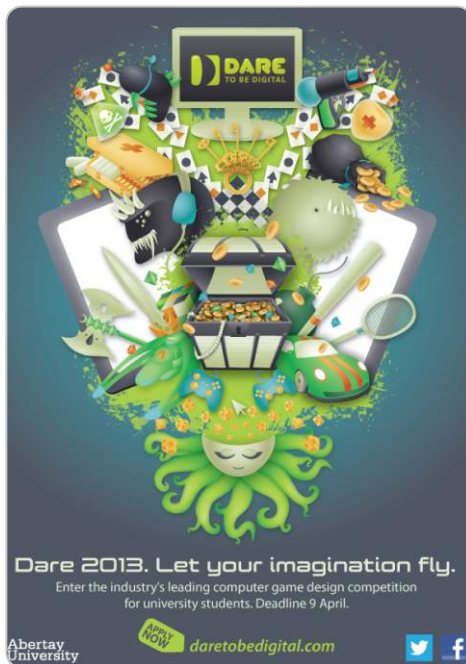
Poster for Dare to be Digital video game design competition