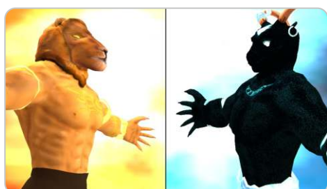
The game in action, the colosseum and the finished characters, textured using CorelDRAW and Corel PHOTO-PAINT