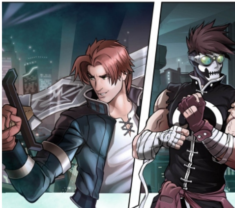
A character named "Zero", created with CorelDRAW