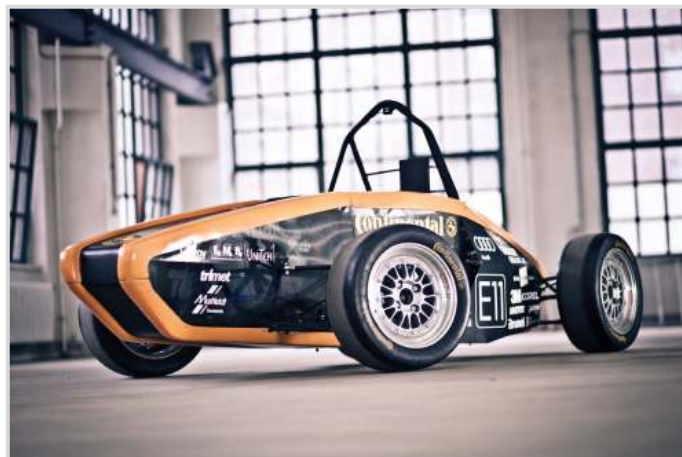
The zedX Vision has a lot of sponsors. The stickers for the logos were all created with the CorelDRAW Graphics Suite.