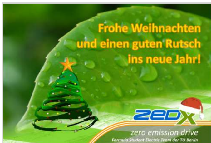
Layout, graphics, colors: The zedX Vision Christmas card was of course also created with Corel software.