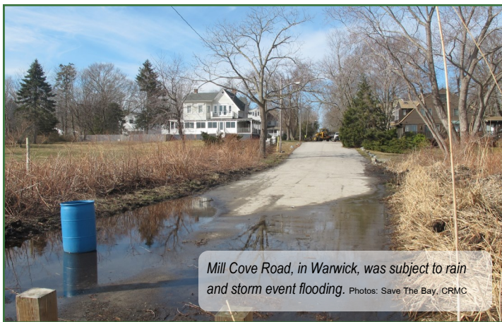
Mill Cove Road, in Warwick, was subject to rain and storm event flooding.

◆ V ! V , Warwick- pavement removed, a filter strip was installed;