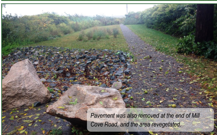
Pavement was also removed at the end of Mill Cove Road, and the area revegetated.

Z " C , in Newport, experienced significant storm-driven erosion and sand overwash onto Ocean Drive during Superstorm Sandy. A small sand dune was restored and planted by volunteers with dune grass. The dune has reduced flooding of Ocean Drive during storm events.