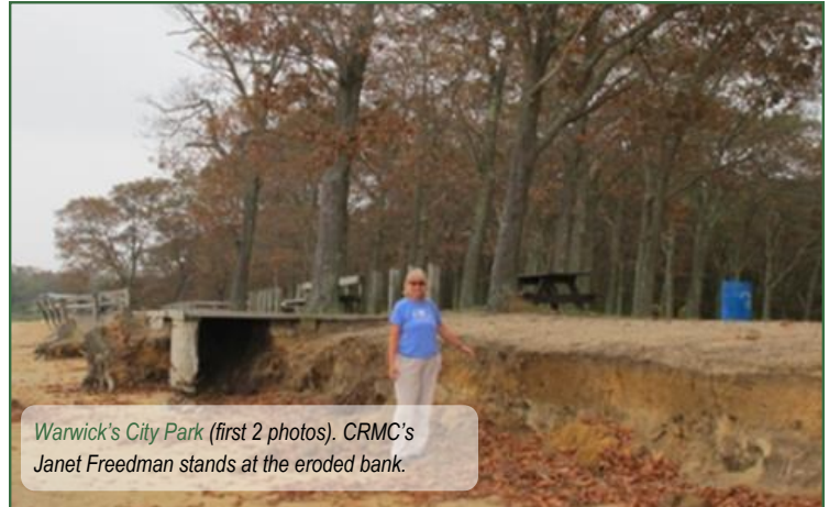
Warwick's City Park (first 2 photos). CRMC's Janet Freedman stands at the eroded bank.

V , a small waterfront park in Cranston, had a severely eroded bank which was a safety hazard. The steep bank was carved back to make a gentler slope to reduce wave energy and lessen erosion. Sand-filled coir tubes were added to the bank in a step formation, then covered and planted with native grasses. During recent storms, the upland edge of the beach and grassy park area in K in Newport had