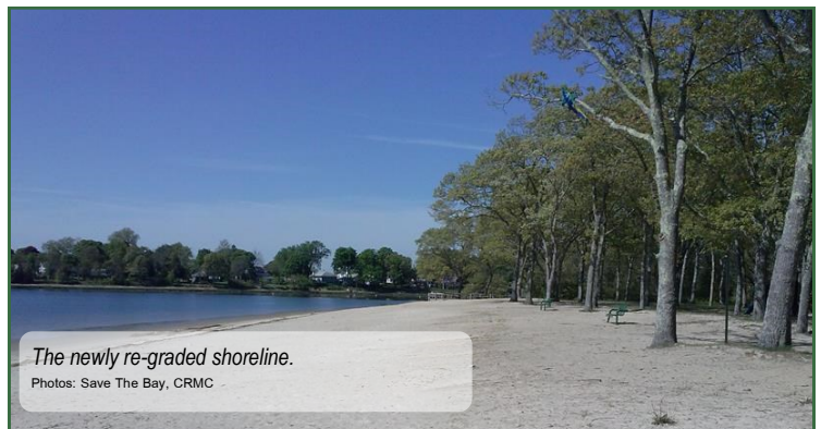
The newly re-graded shoreline.