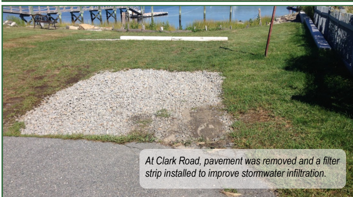
At Clark Road, pavement was removed and a filter strip installed to improve stormwater infiltration.

Many roads along the shoreline suffer from erosion from coastal flooding, storm events, and stormwater runoff. The following projects were designed to address these issues while preserving shoreline habitat and public access.