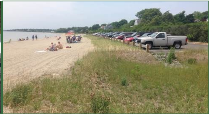
Pictures of Barrington Beach— (Top left) Before: erosion is evident at the western end of the parking area. (Top right) After: the parking lot is reduced in width and beach grass planted. (Right) After: Parking lot pavement removed, beach grass planted. This project also included the installation of stormwater infiltration practices to address runoff from the adjacent streets.