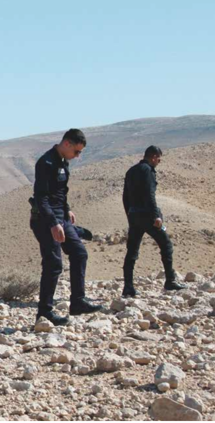
CTBTO on-site inspection regional training course conducted in Cape town, South Africa with participants from 33 African countries