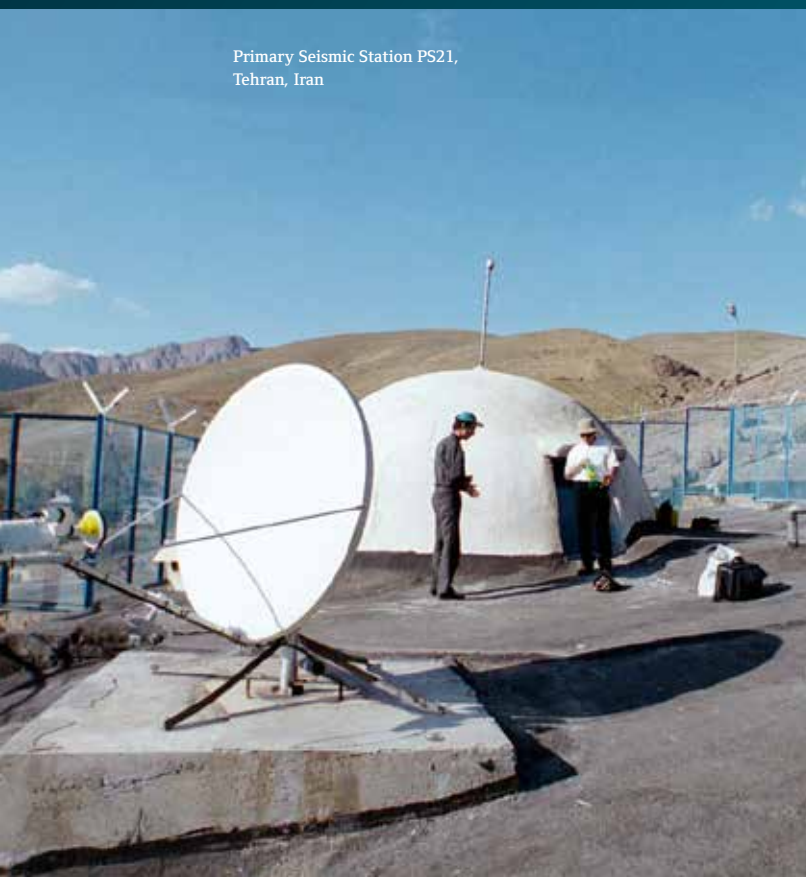
Primary Seismic Station PS21, Tehran, Iran