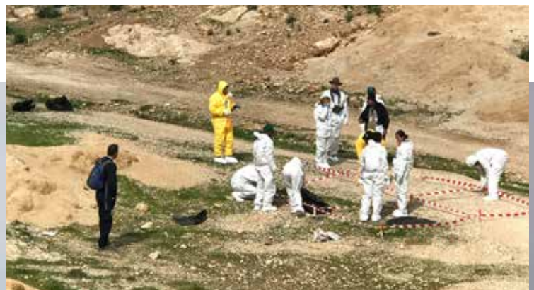
LEFT: CTBTO on-site inspection exercise in Bruckneudorf, Austria (set-up of a base of operations) RIGHT: Integrated on-site inspection exercise carried out near the Dead Sea area of Jordan

The CTBT verification regime is a unique global alarm system with a set of impressive and sophisticated tools to monitor the planet for any nuclear explosion. Member States have the right to access all raw data and analysis products resulting from observations made by this system. It is their prerogative to draw final conclusions about a suspicious event based on information provided by the verification regime. Should data and data analysis point to a possible violation of the CTBT, Member States can take measures to ensure compliance with the Treaty. Such measures include bringing the case to the attention of the United Nations.