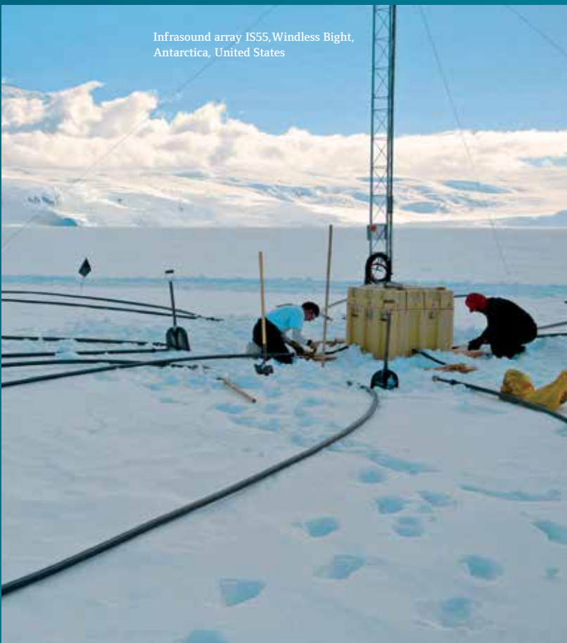
Infrasound array IS55, Windless Bight, Antarctica, United States

The infrasound network of 60 stations uses microbarometers (acoustic pressure sensors) to detect very low frequency sound waves in the atmosphere produced by natural and man-made events. The data enable the International Data Centre (IDC) in Vienna to locate atmospheric explosions and distinguish them from natural phenomena such as meteorites, volcanoes and meteorological events or man-made phenomena such as re-entering space debris, rocket launches and supersonic aircraft.