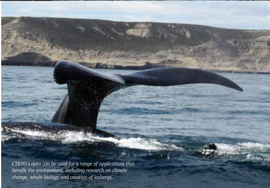
CTBTO's data can be used for a range of applications that benefit the environment, including research on climate change, whale biology and creation of icebergs.

CTBT data have many potential civil and scientific applications. These include natural disaster risk management, research on the Earth's core, monitoring earthquakes, tsunamis and volcanoes, meteor and climate change research, to name but a few. The CTBTO is already providing real time monitoring data to tsunami warning centres in the Indian and Pacific Oceans helping them to issue tsunami warning alerts several minutes earlier than other systems.