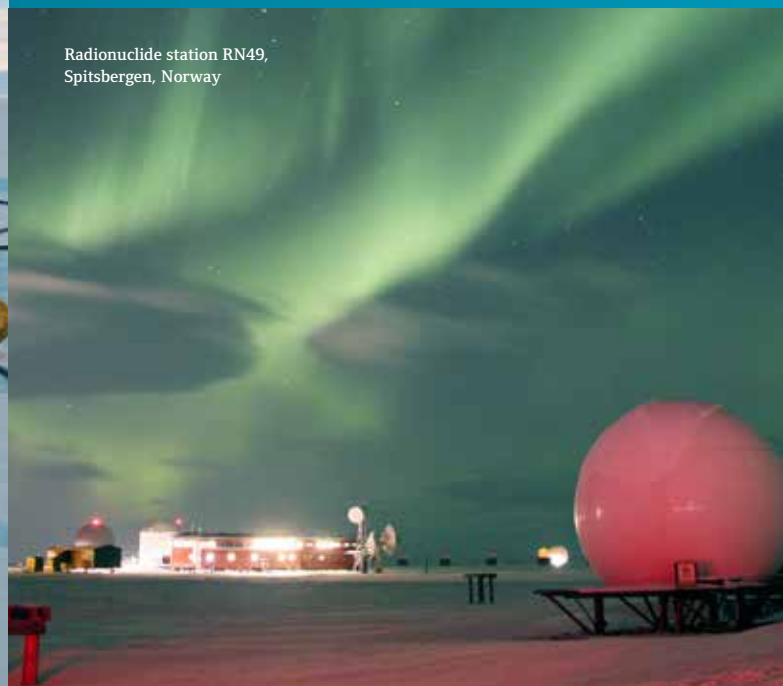
Radionuclide station RN49, Spitsbergen, Norway

The radionuclide network consists of 80 stations which use air samplers to detect radioactive particles released from atmospheric nuclear explosions and those vented from shallow underground or underwater explosions. Half of these stations will also have the capacity to detect radioactive xenon, a noble gas which is a by-product of nuclear explosions and can enter the atmosphere after an underground explosion. The presence of certain radionuclide particles and noble gases and their relative abundance make it possible to identify the source of an emission, i.e. a civilian application or a nuclear test explosion. Thus, the radionuclide technology provides ultimate clarity as to whether or not a nuclear explosion has taken place. The network's 16 radionuclide laboratories make a thorough analysis of radioactive particle samples containing radionuclide materials that may have been produced by a nuclear explosion.