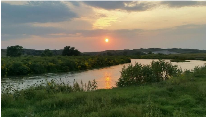
Middle Loup near Thedford