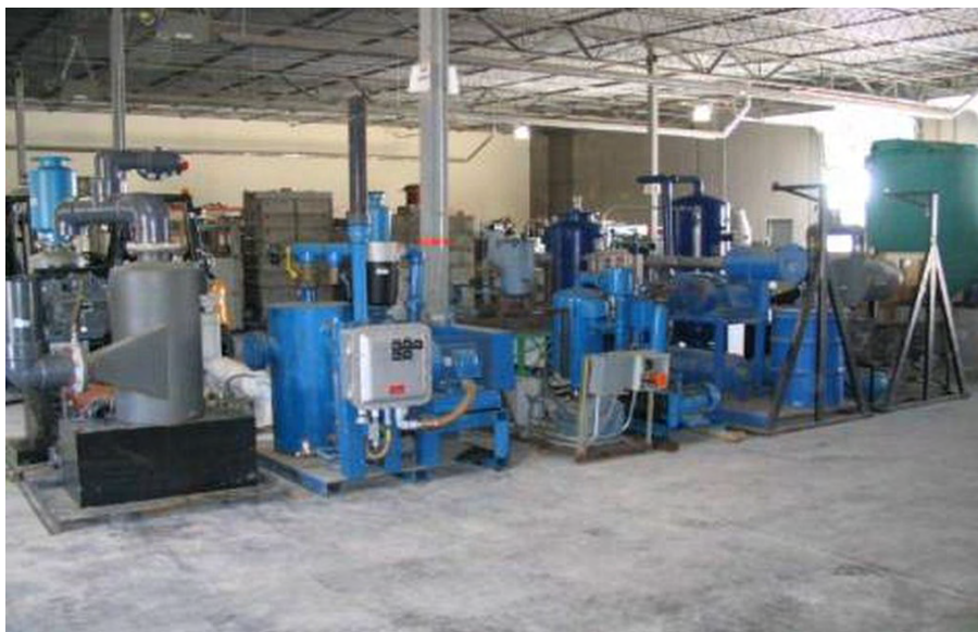
SVE/AS (Soil Vapor Extraction/Air Sparging) systems lined up in the NDEQ Lincoln warehouse facility. The cost of the units runs from $20-40,000 each.

By 2004, the Petroleum Remediation Section had proven that equipment reuse would work, and expressed the need for a larger, more accessible storage building. In June 2005 equipment was moved to a warehouse in Lincoln, the same city as NDEQ agency offices. The new warehouse has a forklift rated to lift 5,000 pounds and a semi-truck loading dock, as well as water, heat, electricity and bathrooms. Low profile vehicles with trailers can drive into the warehouse for loading and unloading and drive through to