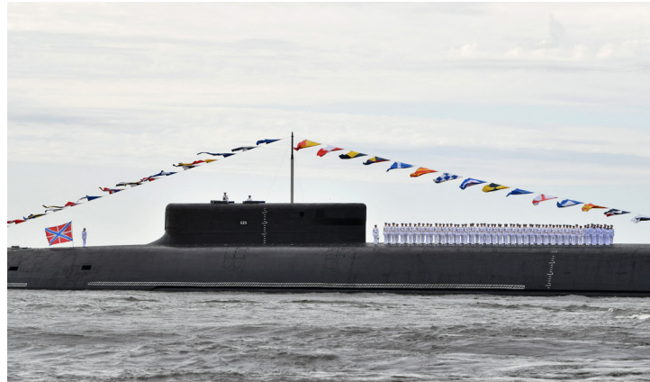
Moscow has several Borey class SSBNs in service, and future construction will likely replace existing Delta-IV SSBNs.

Russia's strategic nuclear weapons triad consists of the Strategic Rocket Force (SRF), SSBNs belonging