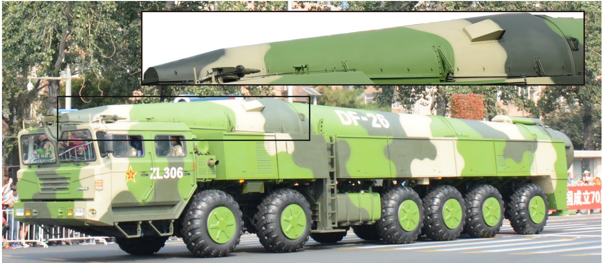
DF-26 IRBM. China continues to field the dual-capable DF-26 IRBM that constitutes its first ever precision-strike nuclear capability. The comingling of nuclear and conventional capabilities raises the potential for inadvertent escalation during a conflict. Note the hinged payload access compartment, (inset) which is unique among China's nuclear capable systems.

planners very likely intend to avoid a protracted series of nuclear exchanges, and state that the scale and intensity of retaliatory force needs to be carefully controlled. 52 China's public declaratory "no first use" (NFU) policy is consistent with this approach to using nuclear force. 53