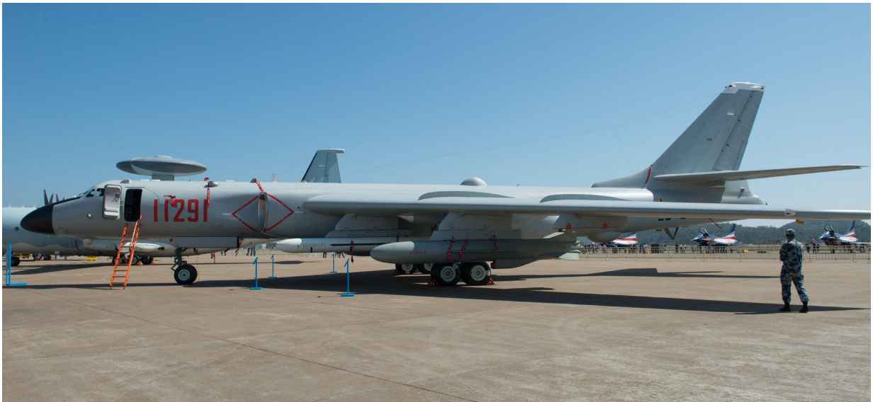
Building Air Based Nuclear Capabilities. The improved H-6N bomber constitutes the nascent air leg of China’s nuclear triad. Distinct from the H-6K pictured above and other variants, the H-6N has an air-to-air refueling capability and a recessed fuselage that can carry a nuclear armed air-launched ballistic missile. China intends to surpass this capability with the H-20 stealth strategic bomber that is under development.

Beijing’s pursuit of enhanced nuclear deterrence over the next decade probably will increase leadership confidence—and the risk of miscalculation—as the PLA makes gradual improvements in its ability to signal and counter the U.S. The PLA’s accompanying doctrinal concepts for employing these new nuclear capabilities probably remain nascent, which may introduce a period during the next several years of escalatory risks because of insufficiently established and predictable tactics, techniques, and procedures. Coupled with PLA officers’ downplaying the risks of imperfect information