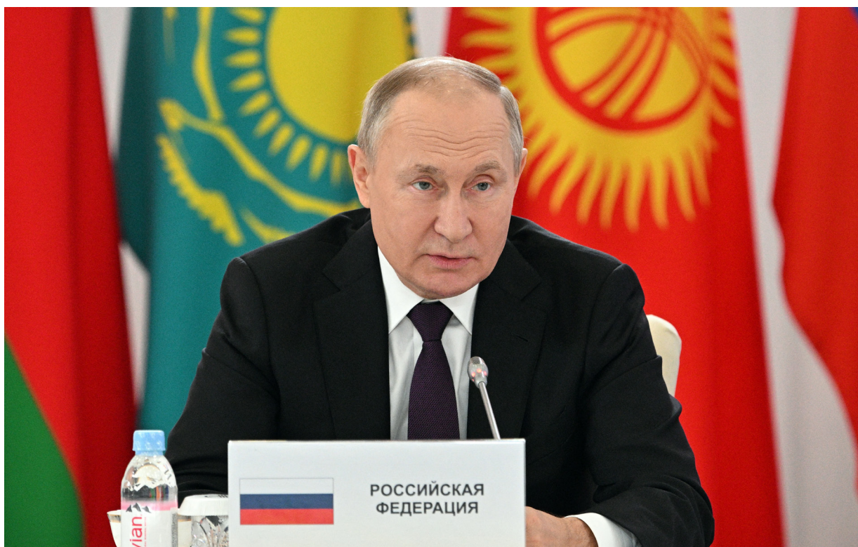
Russian President Vladimir Putin in late September 2022 insinuated that Russia would use nuclear weapons to defend the territorial integrity of the soon-to-be annexed Ukrainian territory.

One specific example is from September 2022, when President Putin claimed that he was not bluffing when he threatened to use nuclear weapons to defend Russia. 157,158