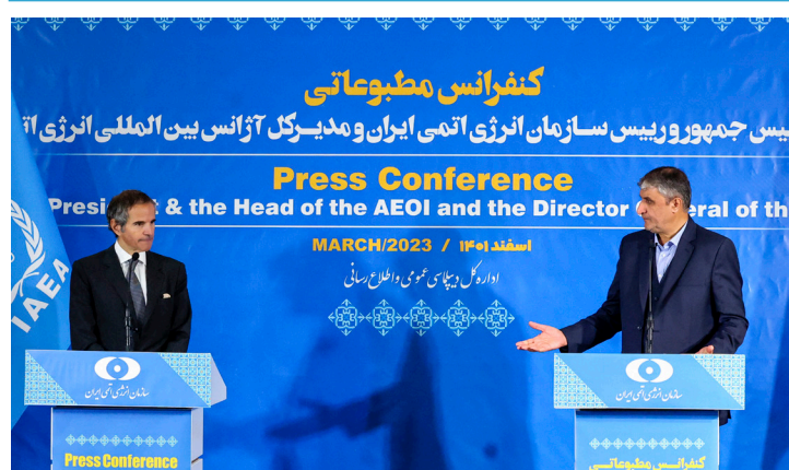
4 March 2023 – Director General Rossi of the AIEA and Eslami, head of the Atomic Energy Organization of Iran.

the PHRC was consolidated under the “Amad Plan,” which was essentially Iran's coordinated and comprehensive effort to develop a nuclear weapon. 298 However, in late 2003, Ayatollah Ali Khamenei declared that Iran is “against any production of weapons of mass destruction in any form,” and Iran halted its nuclear weapons program. This action was primarily in response to increasing international scrutiny and pressure resulting from the exposure of Iran's previously undeclared nuclear work and Operation ENDURING FREEDOM in Afghanistan and Operation IRAQI FREEDOM in Iraq. 299,300 After the halt, Iran continued its efforts to develop uranium enrichment technology, which it first declared to the IAEA in early 2003, when it stated it was constructing two uranium enrichment facilities at Natanz. 301 Iran also constructed an uranium enrichment facility near the city of Qom, where it began enriching uranium to near-20-percent levels in mid-2011. 302,303,304