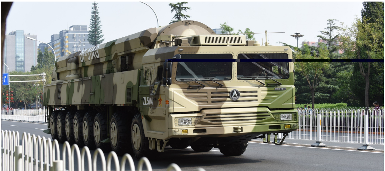
DF-31AG Road Mobile ICBM. China is fielding DF-31 class TEL-based road mobile ICBMs that likely have improved survivability and lethality over previous versions.