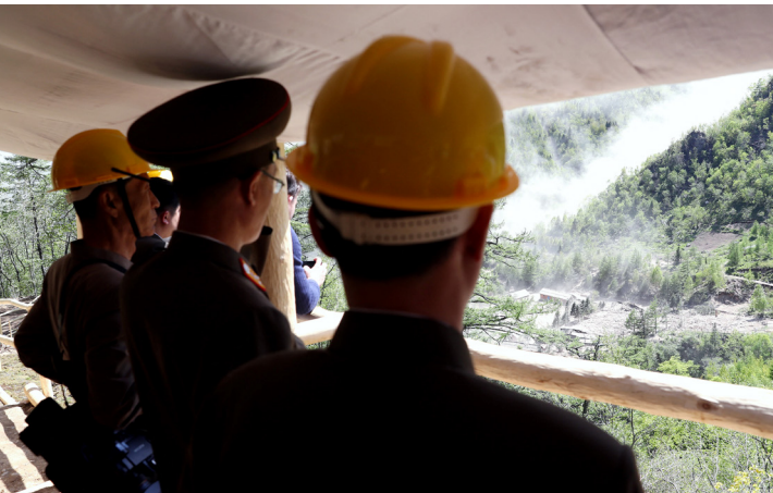
North Korea officials observe the demolition ceremony at the Punggye-ri nuclear test facility in May 2018.

North Korea aims to continue development of its nuclear weapons and delivery options. This was highlighted during the 8th Workers’ Party Congress held in January 2021 when Kim Jong Un called for the advancement of nuclear capabilities to include “ultra-large” and “smaller and lighter” tactical nuclear weapons. 267 Since then, North Korea has conducted a large number of missile test launches to include a new system Pyongyang stated as enhancing its tactical nuclear operation; additionally, North Korea has started reconstitution efforts at the Punggye-ri nuclear