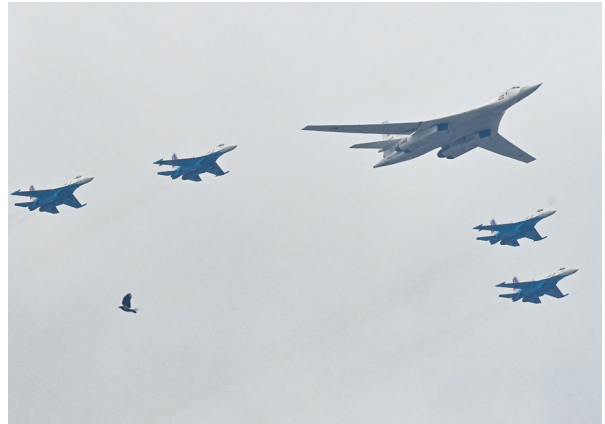
Russia will restart production of Blackjack bombers (pictured in the lead above) as a stop-gap measure until the PAK-DA bomber is ready to be fielded.

Russia's fleet of strategic bombers constitutes the air element of its strategic nuclear triad. Like other components of the triad, the LRA's main strategic assets—Tu-95 Bear and Tu-160 Blackjack bombers—are being modernized to continue operating beyond 2030. Russia has announced that it will resume production of Tu-160M2 bombers, and will complete development of a new generation bomber (Russian designation: PAK-DA) within a decade, but timelines for both programs may slip if financial difficulties persist. The new bomber design is expected to have some stealth capabilities, short- or rough-runway capabilities, and to employ both conventional and nuclear armament. 186,187