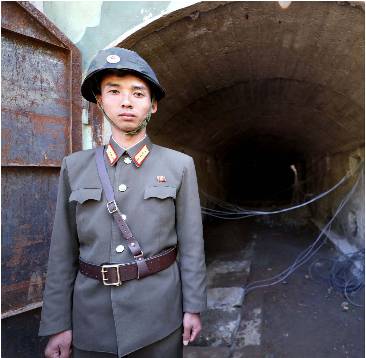
The entrance to a tunnel at the Punggye-Ri nuclear test site prior to the May 2018 demolition ceremony.

expressed the need to rapidly modernize its nuclear forces at the “fastest possible speed.” 277