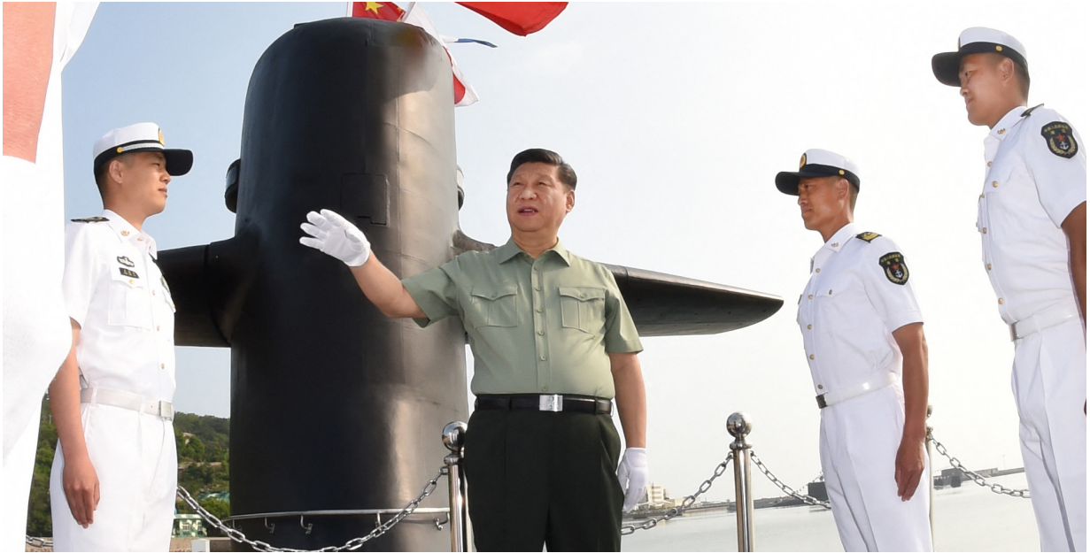
President Xi Jinping has stated China's "sea-based nuclear force needs to develop greatly." Here he is commissioning a Type 094 SSBN in April 2021. With six SSBNs now in service, China has enough to establish continuous peacetime deterrence patrols. These submarines have SLBMs with the capability to range the United States from Chinese waters.

management during crises, inexperience managing nuclear crises, and their perceptions that they can elicit intended adversary responses while maintaining sufficient battlefield awareness, Beijing may accept greater risks as its nuclear doctrine and capabilities mature. 134 As China continues its effort to accelerate nuclear modernization and expansion, we expect to see the following developments—listed in no particular order—that will blur conventional and nuclear boundaries: