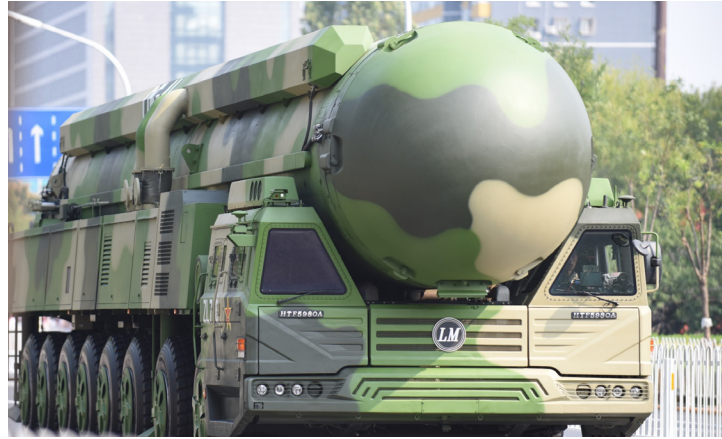
DF-41 road mobile ICBM. China continues to field its first road-mobile ICBM with MIRV capability. This system likely has improved range and accuracy over DF-31 class ICBMs.