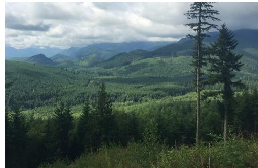
Forested state trust lands

The Washington Department of Natural Resources (DNR) manages 2.1 million acres of forested state trust lands in Washington State. DNR manages these lands to generate revenue for trust beneficiaries such as counties, schools, and universities, and to meet a suite of ecological objectives such as biodiversity.