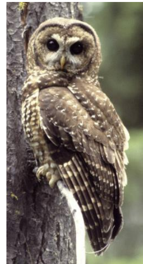
Northern spotted owl

According to a recent study completed by DNR 5 , between 1999 and 2017 there was little net change in the number of acres of forest on state trust lands that are either have, or are beginning to develop, the attributes of structural complexity. However, the location of these forests has shifted: