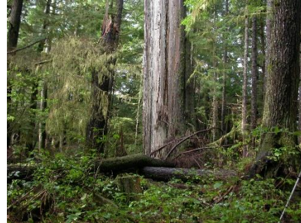
A structurally complex forest on state trust lands in western Washington

Potential management approaches developed by the work group will be shared with research contractors, who will quantify their impacts on carbon budgets as well as regional wood supplies, jobs, mills, and rural economies. This data-driven approach will enable work group members and DNR to understand clearly the pros and cons of each approach. In addition, a research contractor will complete a wood supply study to help the work group understand both current and future wood supply and demand, and how changes in wood supplies may affect the timber industry. This work complements other climate change initiatives that DNR has undertaken in recent years (Text Box ES 1).