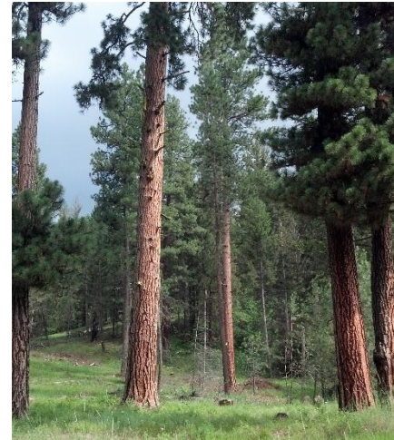
Ponderosa pine in eastern Washington

In the following section, DNR will discuss the major steps of this project.