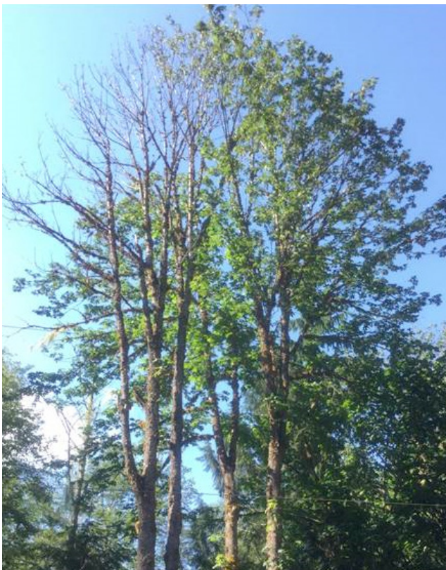
Many bigleaf maple trees in Washington have exhibited symptoms of decline, including partial to entire crown dieback, discoloration and reduced leaf size, loss of leaves and death.