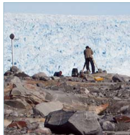
Jakobshavn Isbrae glacier

EOS SCIENTIST Mark Fahnestock has teamed up with researchers from the Geophysical Institute at the University of Alaska Fairbanks (UAF) to investigate the recent, rapid acceleration of a large Greenland outlet glacier by deploying Global Positioning System receivers directly on the glacier. Jakobshavn Isbrae (background) flowed at a stately 20 meters per day for the last half century, but recently accelerated to 40 meters per day in response to the loss of a floating ice tongue that blocked rapid progress down the fiord.