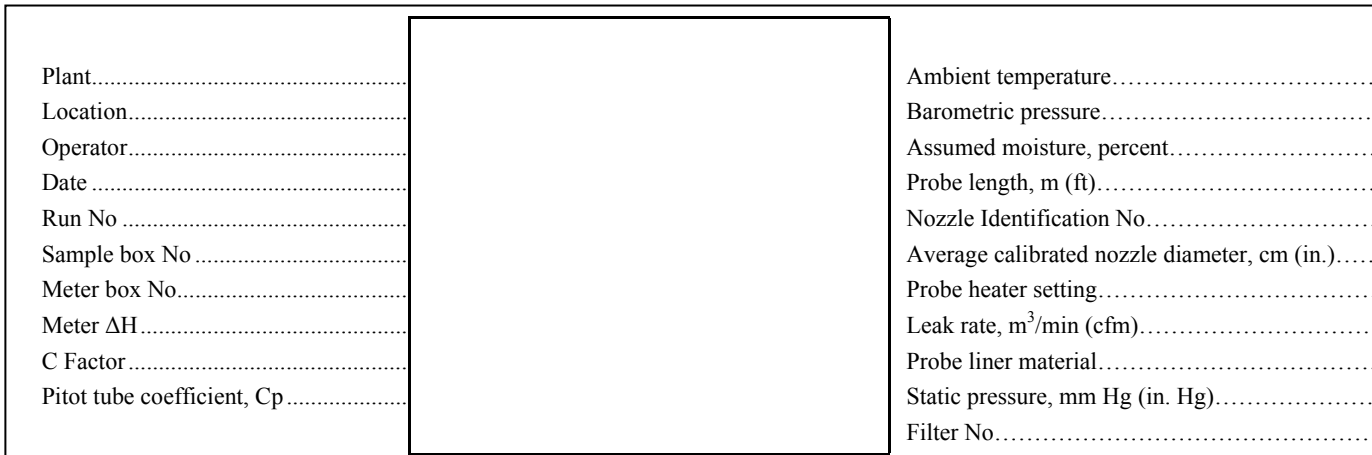
SCHEMATIC OF STACK CROSS SECTION