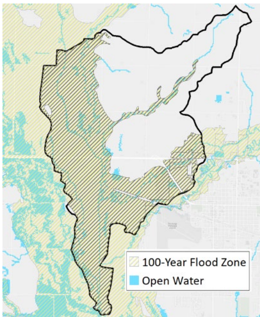
Figure 2. Overlay map of the flood zone, open water, and HUC12 boundaries for an example HUC12.

The 100-year flood zone map layer was overlaid with HUC12 boundaries, surface water features in the medium-resolution National Hydrography Dataset, and surface water areas in the 2016 National Land Cover Database (Figure 2). Together, these datasets were used to calculate the area of land in the 100-year flood zone per HUC12 (note that lakes, rivers, and other waterbodies were not counted when calculating the flood zone area per HUC12). The flood zone area was then converted to a percentage of the total HUC12 area.