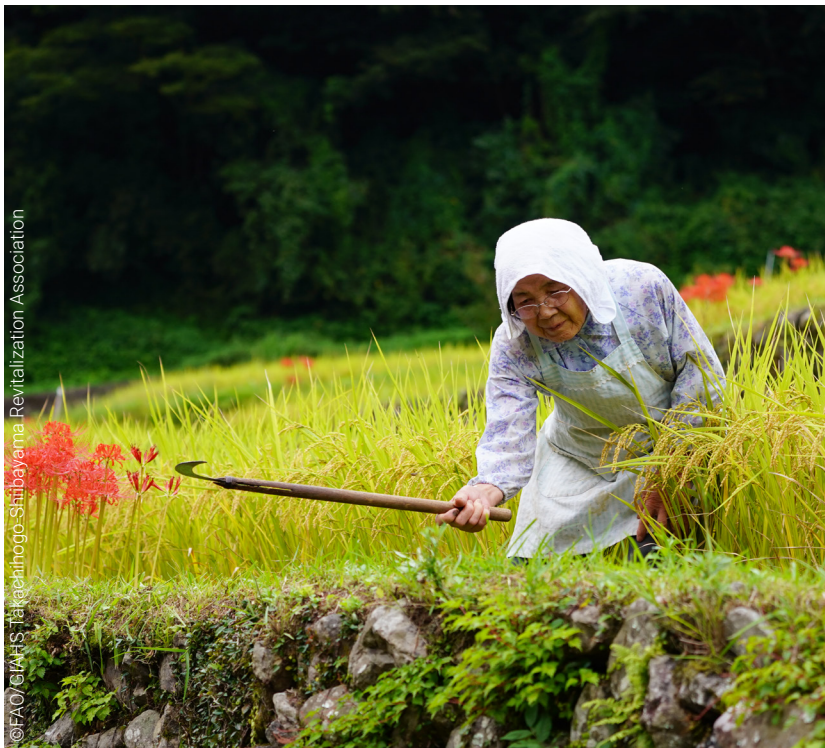
Right photo: Takachihogo-Shiibayama Mountainous Agriculture and Forestry System in Japan. In this severe environment, the local population has established a distinctive and sustainable agriculture system.