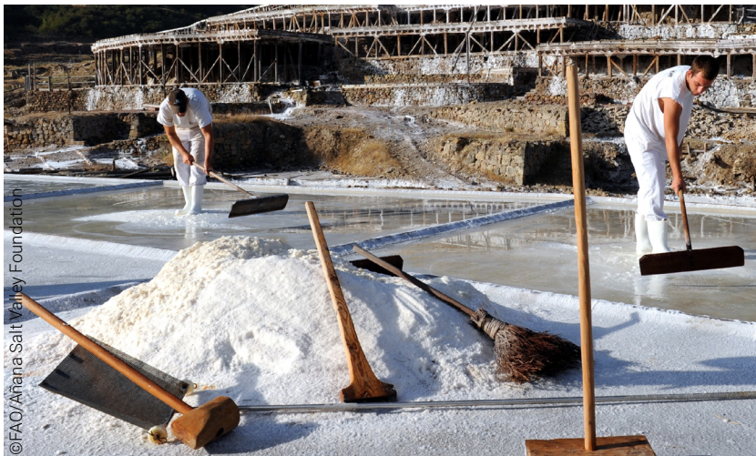
Right photo: The Agricultural System of Valle Salado de Añana in Spain. Designated agricultural heritage by FAO in 2017. This productive system is a unique testimony to a traditional agricultural way of life.