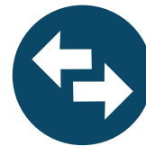
trading and financing platforms.

These three types are often interconnected and, as such, provide broader, end-to-end services. The result is often increased efficiency, with IT-engaged companies reporting feed conversion ratio (FCR) reductions that ranged between 5 percent and 28 percent in 2020 (Aqua Spark, 2020).