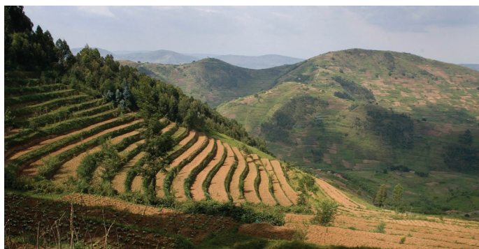
A view of terraced hills, which help soils retain water and prevent erosion.