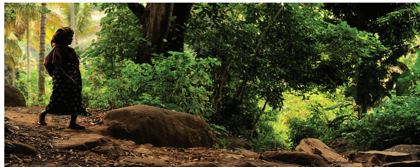
A woman crossing one of several streams which feed an irrigation canal used for climate-smart agriculture in Tanzania.

Food and Agriculture Organization of the United Nations