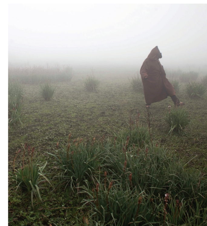
A villager walking through a peat bog in Tunisia.