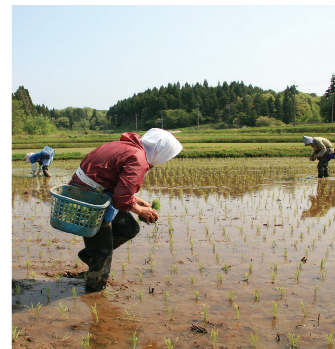
Sustainable Satoyama–Satoumi landscape management in Japan builds resilience to climate change.

emission of greenhouse gases from agriculture, enhance carbon sequestration and build resilience to climate change.