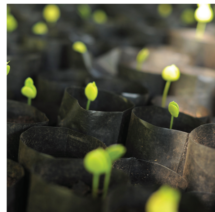
Moringa seedlings at a tree nursery. The moringa tree can play an important role in mitigating climate change and increasing the incomes of poor farmers in Africa.

Climate change represents a serious threat to global food security, not least because of its effects on soils. Changes in temperature and rainfall patterns can have a great impact on the organic matter and processes that take place in our soils, as well as the plants and crops that grow from them. In order to meet the related challenges of global food security and climate change, agriculture and land management practices must undergo fundamental transformations. Improved agriculture and soil management practices that increase soil organic carbon, such as agro-ecology, organic farming, conservation agriculture and agroforestry, bring multiple benefits. They produce fertile soils that are rich in organic matter (carbon), keep soil surfaces vegetated, require fewer chemical inputs, and promote crop rotations and biodiversity. These soils are also less susceptible to erosion and desertification, and will maintain vital ecosystem services such as the hydrological and nutrient cycles, which are essential to maintaining and increasing food production. FAO also promotes a unified approach, known as Climate-Smart Agriculture (CSA), to develop the technical, policy and investment conditions that support its member countries in achieving food security under climate change. CSA practices sustainably increase productivity and resilience to climate change (adaptation), while reducing and removing greenhouse gases whenever possible (mitigation).