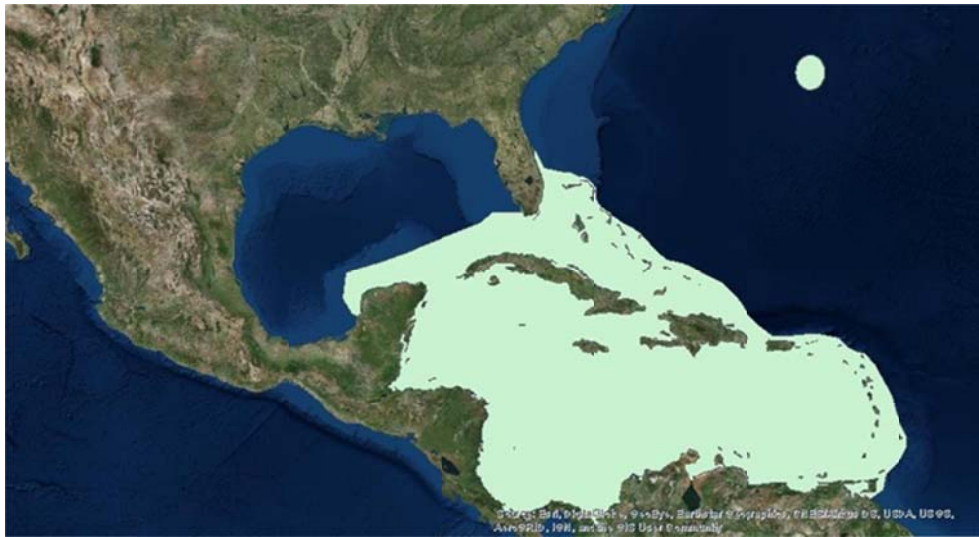
Figure 1. Range of Nassau grouper ( Epinephelus striatus ).

Nassau grouper occur in Bermuda and Florida, throughout the Bahamas and the Caribbean Sea (Figure 1). Their distribution within Florida is from Cape Canaveral south through the Florida Keys and Florida Bay westward to the Dry Tortugas and Pulley Ridge. They are fairly uncommon in Florida, with mixed accounts of historical abundance, and are considered rare in the Gulf of Mexico. As with most large marine fishes, Nassau grouper demonstrate a bi-partite life cycle with demersal adults and juveniles but pelagic eggs and larvae.