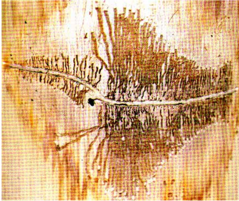
Figure 3 -- An egg gallery with an adult fir engraver and larvae at the end of their parallel galleries.

When fir engraver populations are endemic, trees are still killed, but losses are less severe.