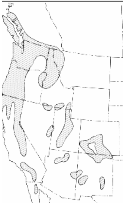
Figure 2 —Distribution of the fir engraver.

severe. In New Mexico, some 37,000 trees were killed in 1954 on about 700 acres (2,800 ha) in the Cibola National Forest.