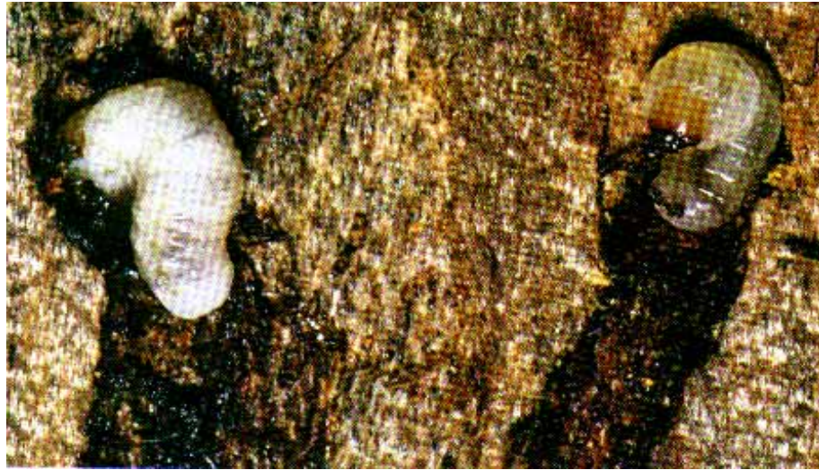
Figure 6 -- Larvae at the end of their galleries beneath the bark of a California red fir.

Four to six days after the female begins boring the egg gallery, a yellowish-brown discoloration appears on the surrounding area. The stain is caused by the fungus Trichosporium symbioticum Wright, which is carried by the beetles.