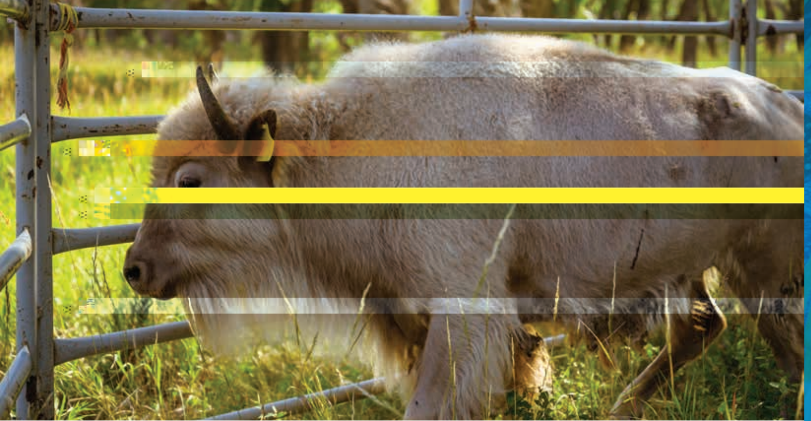
Buffalo in a fence on harvest day.