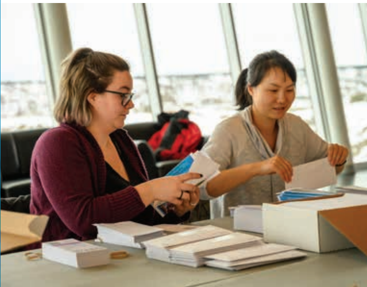
Volunteers assemble materials for mailing.