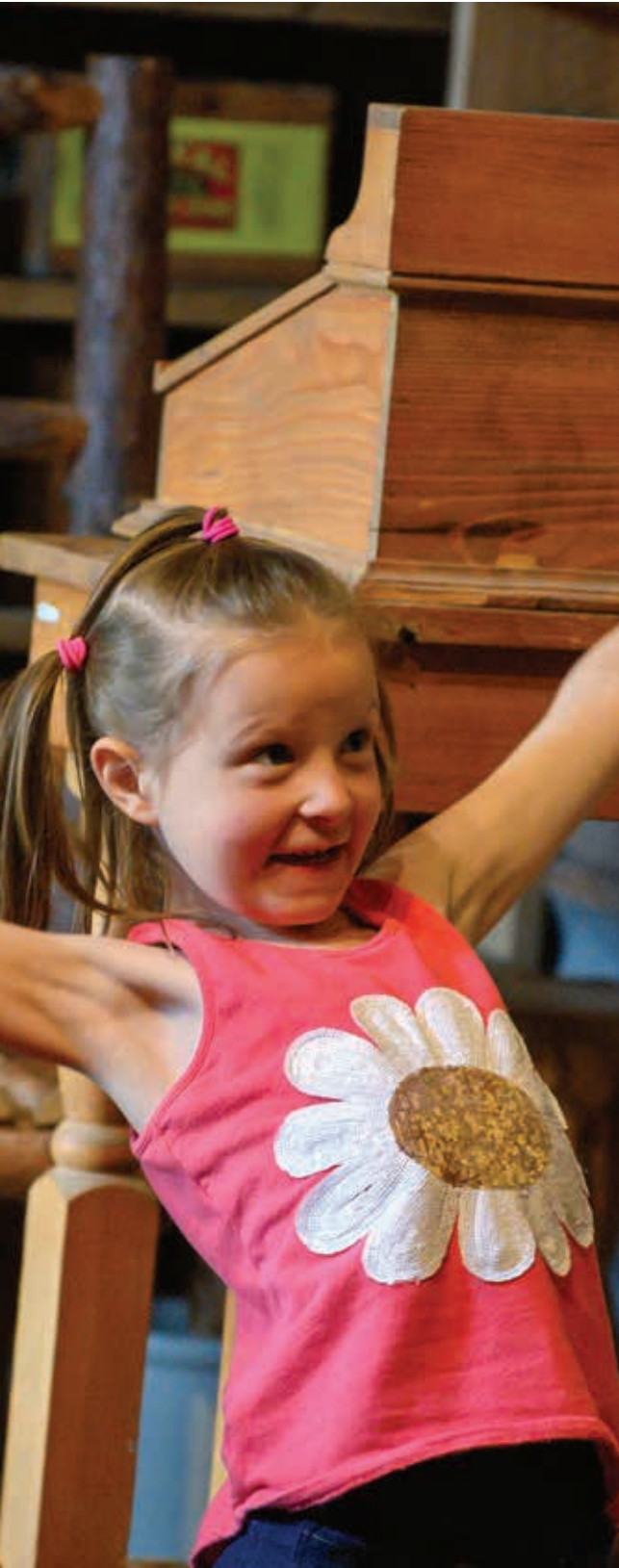
Students visit the fort for a school program.