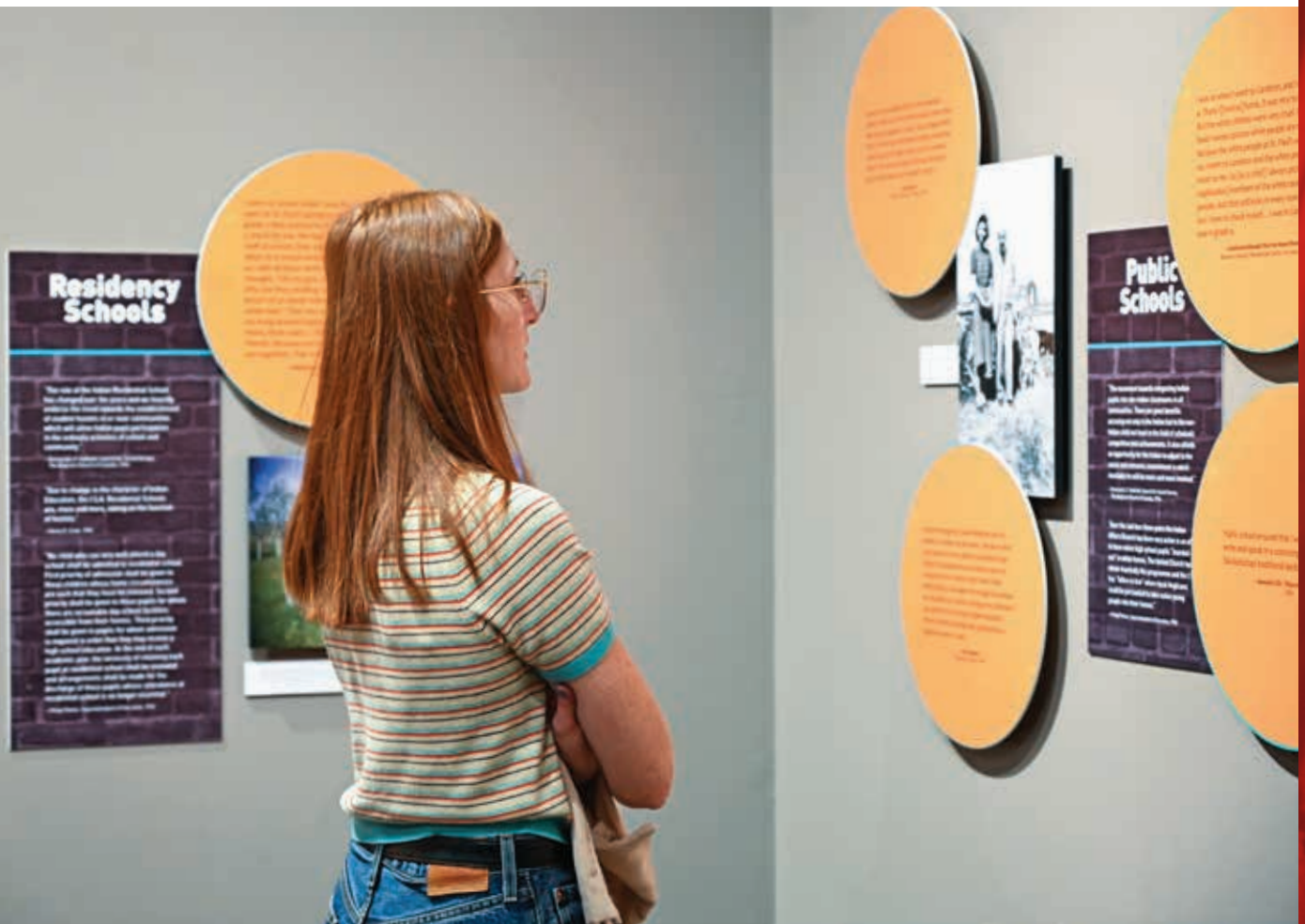
Visitor explores the Stolen Kainai Children exhibit.

Out of the 19 traveling exhibit displays in 2023, 13 were permanent copies of Nitsitapii Landscapes Part 1 purchased by schools in Lethbridge School District No. 51.