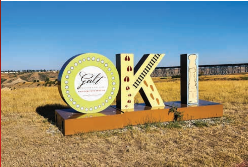
Above: The Oki sign outside the Museum.