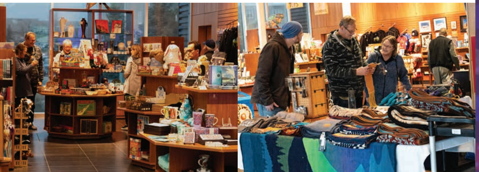
The annual Night at the Museum holiday shopping event.