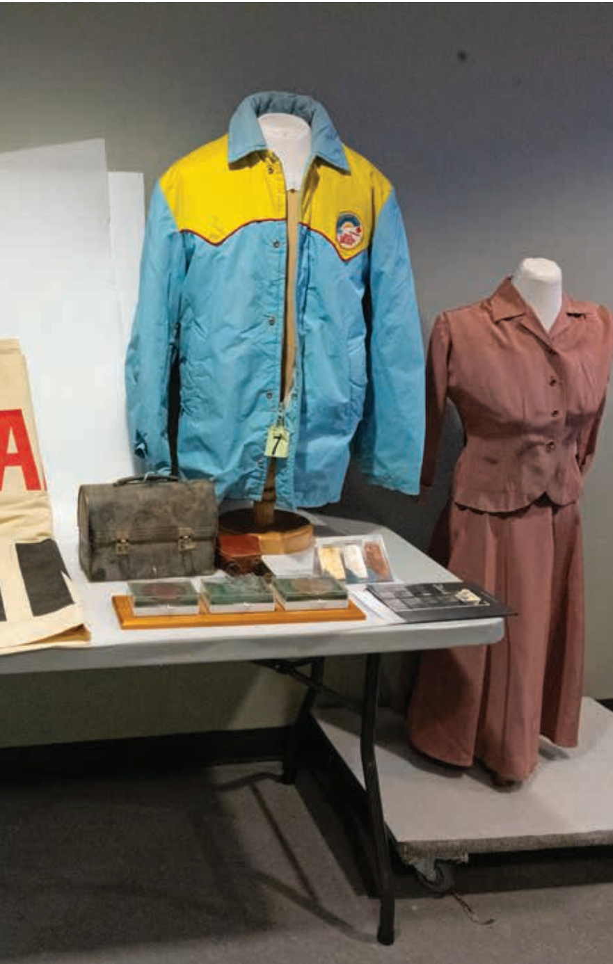
Nine artifacts from the community were carefully examined by the Acquisition Committee on November 27, 2023 before making recommendations for them to be accessioned.