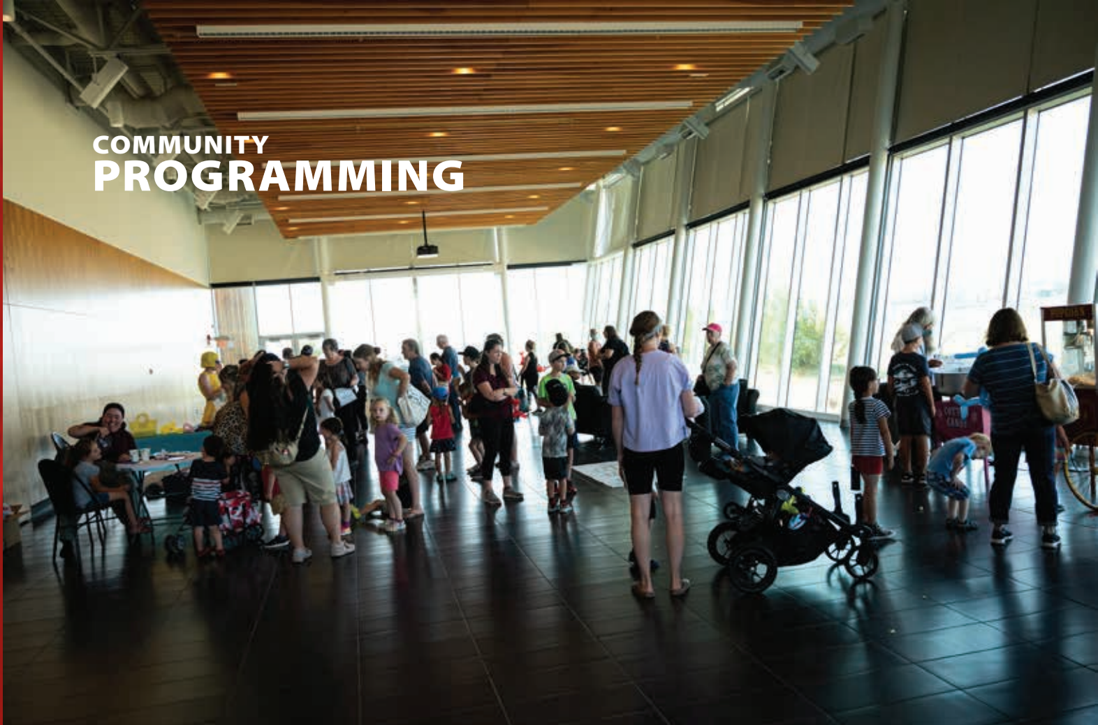
Participants enjoying Carnival activities and games at the Galt Viewing Gallery!