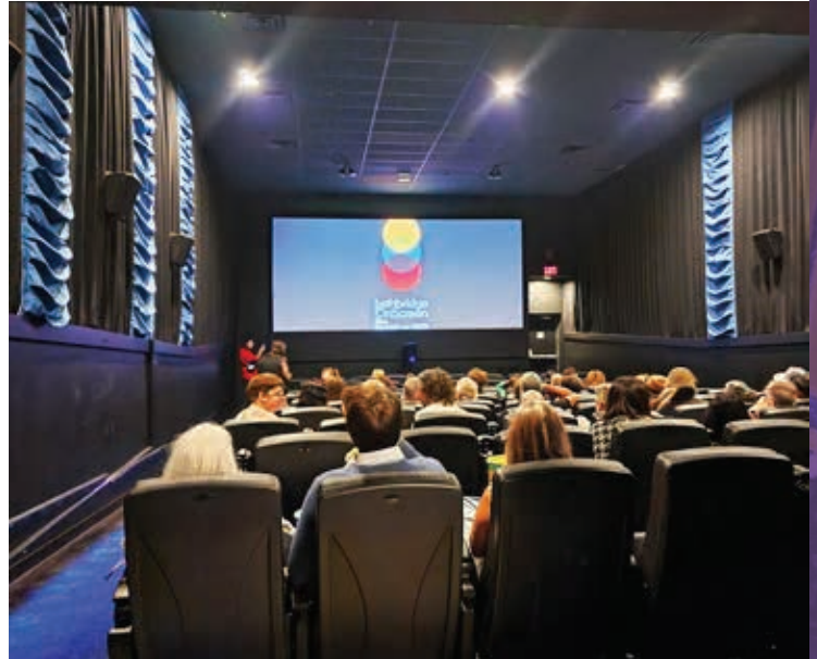
Festival film screening at The Movie Mill cinema.

Festival attendees were treated to a red carpet experience at both the Galt and the Movie Mill.