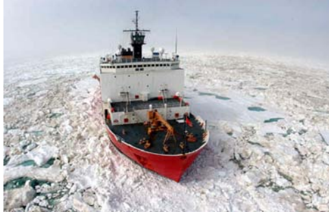
Image 2: The Coast Guard Cutter Healy is the United States' most technologically advanced icebreaker 30

much higher in this region. Many provisions of UNCLOS address shipping and its relation to the protection of the marine environment and pollution from ships. International entities such as the International Maritime Organization and the Arctic Council have addressed the issues that are likely to arise with the increase of shipping into, out of, and through the Arctic. The U.S. Arctic policy dates to 1994. However, climate change and the increase in shipping has prompted the need for key changes to that policy that are being addressed in a forthcoming update of the 1994 policy. The top priorities of the U.S., revised for today's Arctic circumstances, will be to facilitate safe, secure, and reliable navigation, to protect maritime commerce and the marine environment.