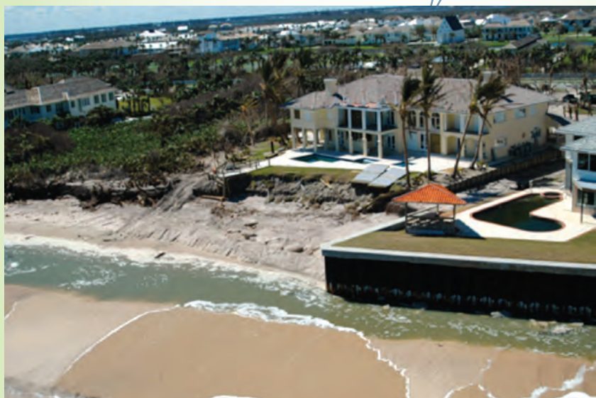
The sea wall on the right reflects wave energy and exacerbates erosion on the adjacent properties.