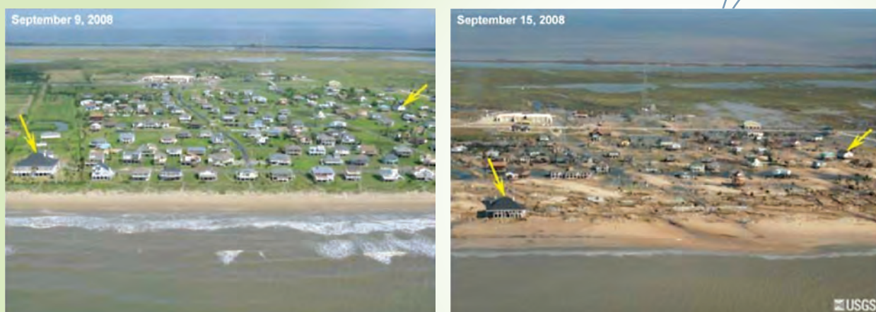
FIGURE 4: Shoreline Before and After Hurricane Ike (Galveston, Texas)

These photos show the movement of the vegetative line before and after Hurricane Ike.