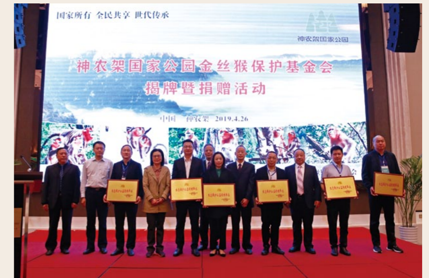
◆ Representatives from donating enterprises and individuals with leaders of Shennongjia UGGp

Director General of the Administration of Shennongjia National Park, said at the unveiling ceremony that the establishment of the Foundation is an action of Shennongjia UGGp in its efforts to establish a financing system with diversified modes and sources, with the aim of gathering more strength to protect the bio-diversity of Shennongjia UGGp.