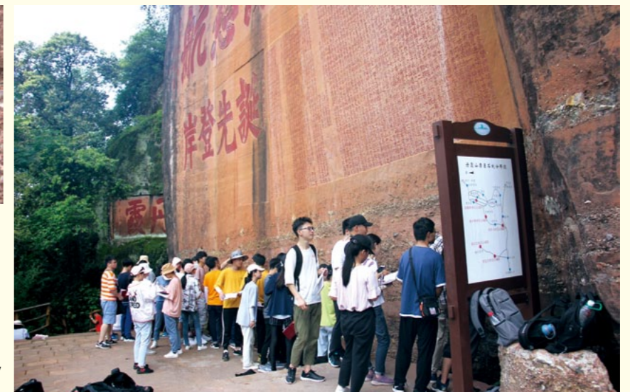
◆ Internship team from East China University of Technology inspects Danxia landform