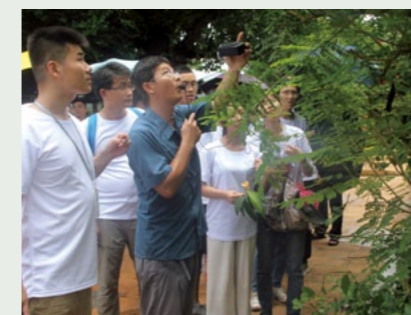
◆ A professor of South Subtropical Crop Research Institute explains the tropical plant knowledge to volunteers.