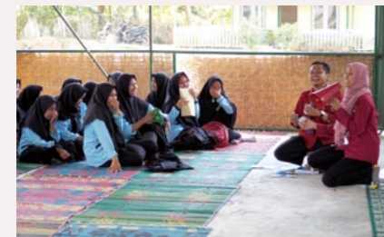
◆ Discussion about geopark and geohazard with Islamic Boarding School students in Batukliang Districts

From beginning of October until 15th October 2019, The Rinjani - Lombok UGGp collaborate with several Provincial Offices, the Indonesian Geologist Association, The Village of Tanak Beak and its Samalas Geotourism Working Group, conducted several activities related to education, conservation and community empowerment. We start our activities by published and promoted about this event and also campaign about disaster risk reduction in some online medias of provincial government, Geoparks and partners. Next, the activities are grouped into Geopark Goes to School and Green Camping as the highlight