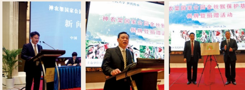
◆ Press Conference on the Establishment of the Foundation ◆ Deputy Director General of Shennongjia UGGp Hosting the Ceremony ◆ Unveiling the Foundation