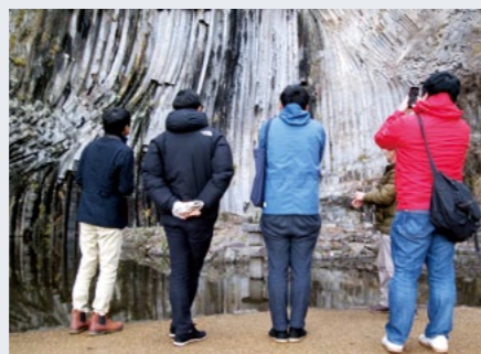
◆ Genbudo Cave, Geosite with International Significance