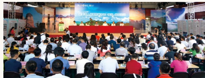
◆ The Global Geoparks of China Science Popularization Exchange Conference in Danxiashan 2019

a famous scientific mountain, as well as how scientific research and science popularization are carried out at the mountain. The development of scientific research and science popularization of UGGps were discussed during the event. Scientific advisers and managers of Danxiashan UGGp, in addition to managers from different classes of Danxiashan Science Popularization Town, delivered overall presentations and shared their ideas in detail, from the perspectives of "diversified Danxiashan scientific research and science popularization", "industrialization of science popularization" and "Nature Academy & field research". The representatives from the various UGGps conducted in-depth discussions on developing the brand of UGGps, protecting resources,