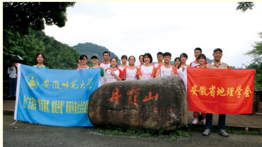
◆ Team photo of Anhui Normal University

Recently, more than 1,000 teachers and students from about 20 universities in China, including Sun Yat-Sen University, Guangdong University of Finance and Economics, East China University of Technology, Anhui Normal University, Guangdong University of Education, Wuhan University of Engineering Science, Shaoguan University and others gathered at Danxiashan for internship and study. The students carried out professional research in an all-round way in Danxiashan under the guidance of their teachers and Danxiashan science tutors, aiming toward further deepening the understanding of the geological ecology and humanity of Danxiashan. The series of activities they organized help the students combine the theory they learned with practice. The internship programs vary according to the subjects that the students are currently focused on learning at their universities.