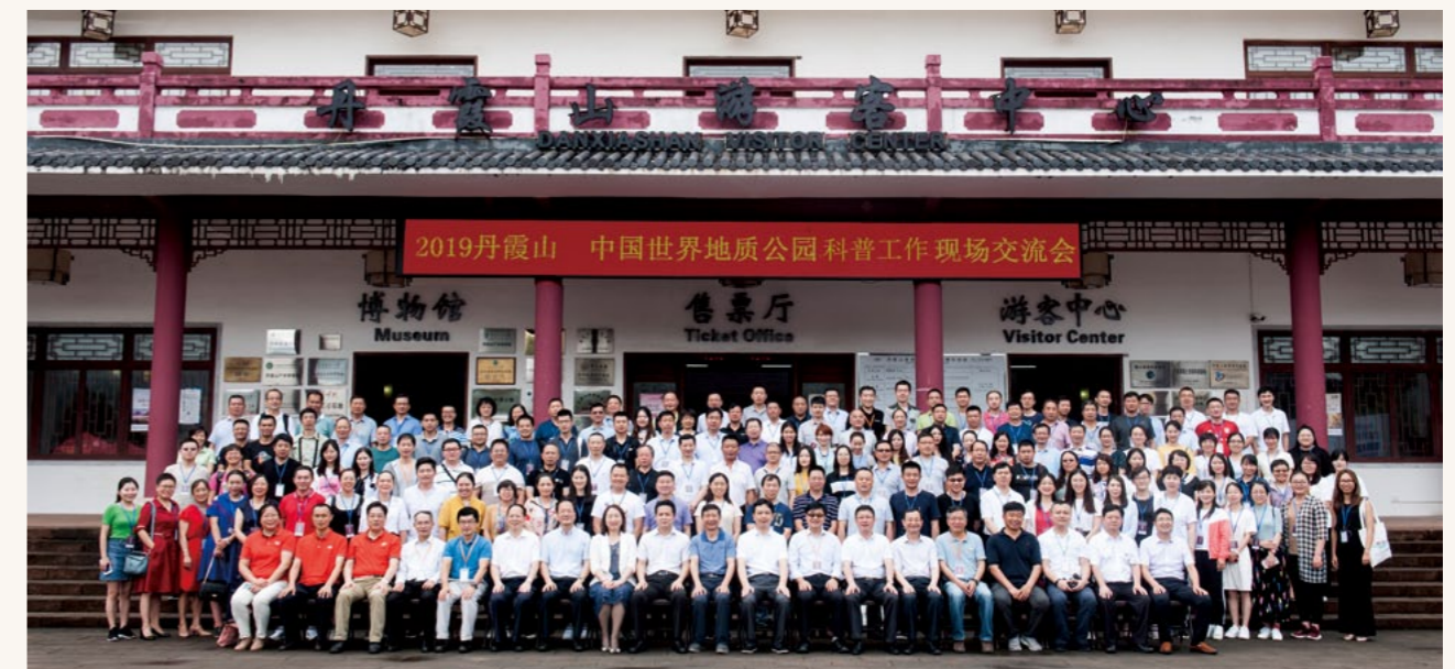
◆ A group photo taken by delegates at the Global Geoparks of China Science Popularization Exchange Conference in Danxiashan 2019