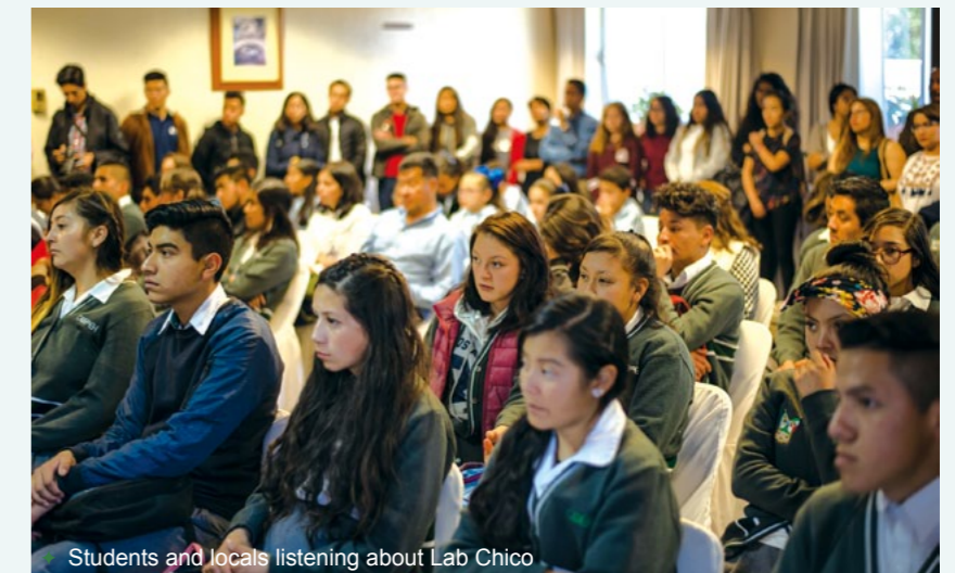
Students and locals listening about Lab Chico