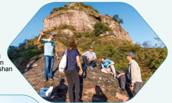
Inspecting the rocks in Guanzhaishan