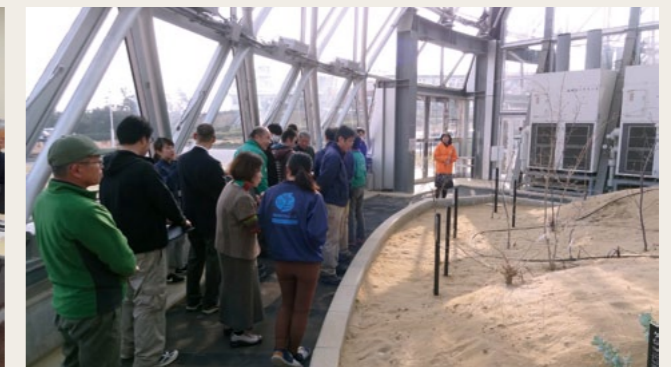
◆ Lecture inside research center