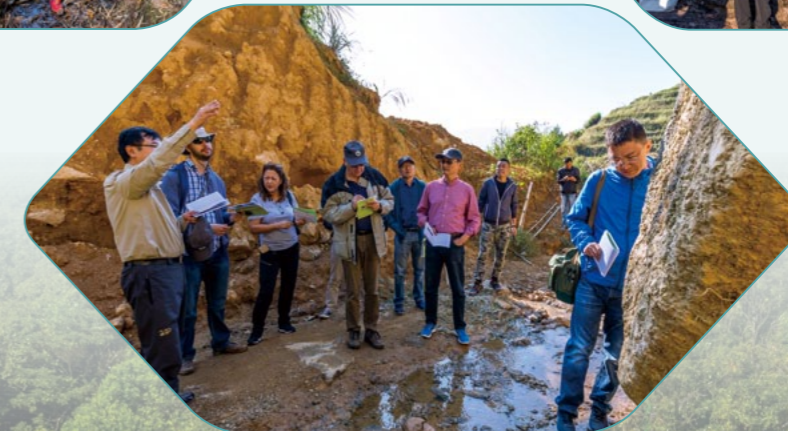
Examining the Indosinian (~220Ma) monzogranite with K-feldspar megacrysts