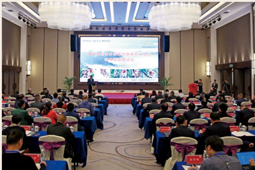
◆ The Unveiling Ceremony

species, is the flagship species of Shennongjia's biodiversity conservation. As a sub-species of Sichuan Snub-Nosed Monkey, the Golden Snub-Nosed Monkey of Shennongjia plays an important role in the evolution history of species, and the conservation of its population is significant for the conservation of the genetic diversity of the species of the Sichuan Snub-Nosed Monkey.