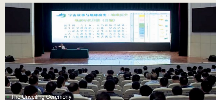
The Unveiling Ceremony

Huanggang Dabieshan UNESCO Global Geopark, China hgdzgy@163.com