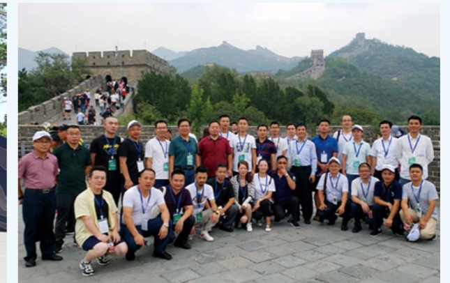
Visit Badaling Area