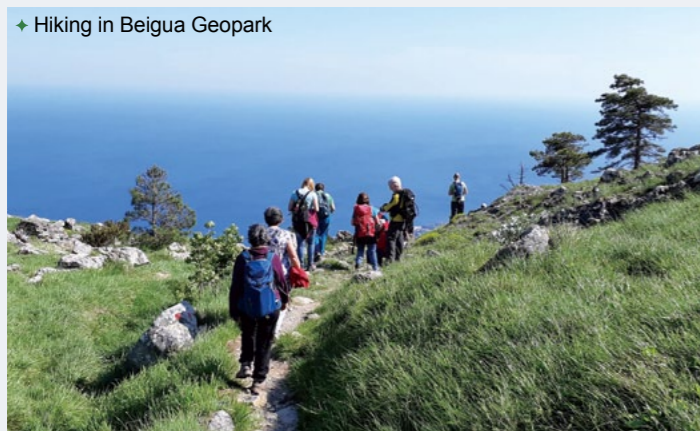
✦ Hiking in Beigua Geopark