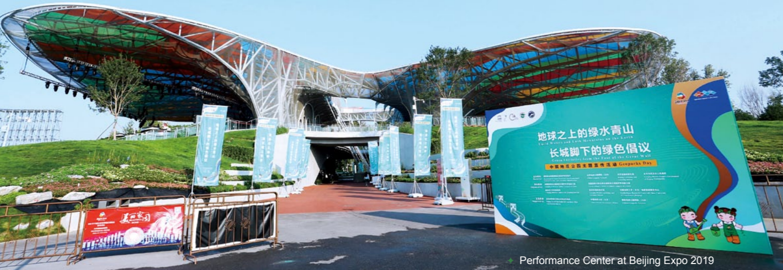
Performance Center at Beijing Expo 2019