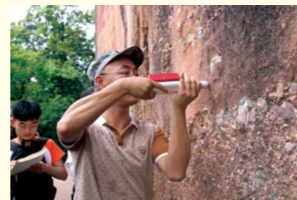
◆ Anhui Normal University led the team teacher to teach on the spot