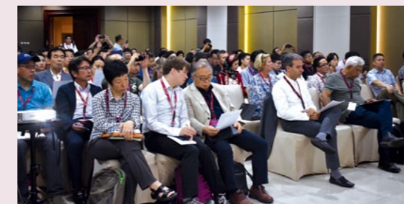
Coordination Committee meeting

Coordinators and new Advisory Committee of the APGN were elected.