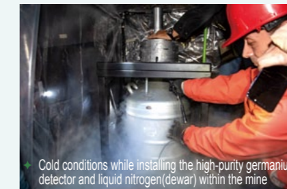
Cold conditions while installing the high-purity germanium detector and liquid nitrogen (dewar) within the mine