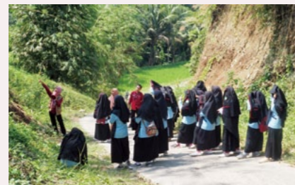
◆ Field trip introducing nearby geological features to Nurul Irsyad students