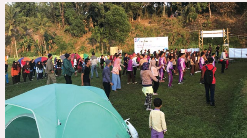
◆ Preparation of Green Camping