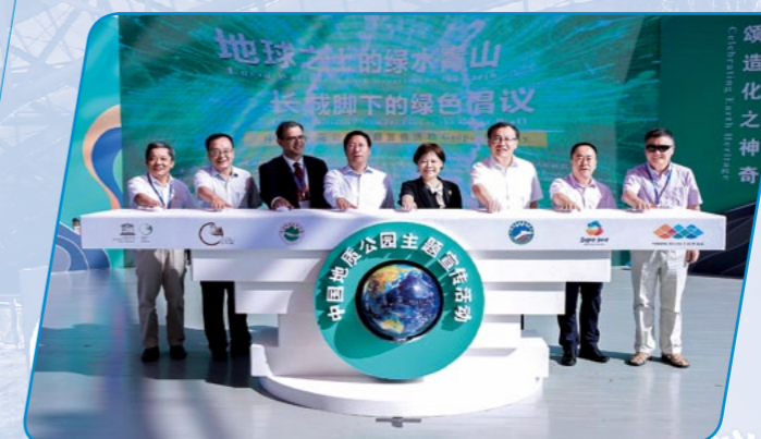
Geopark's Day in China