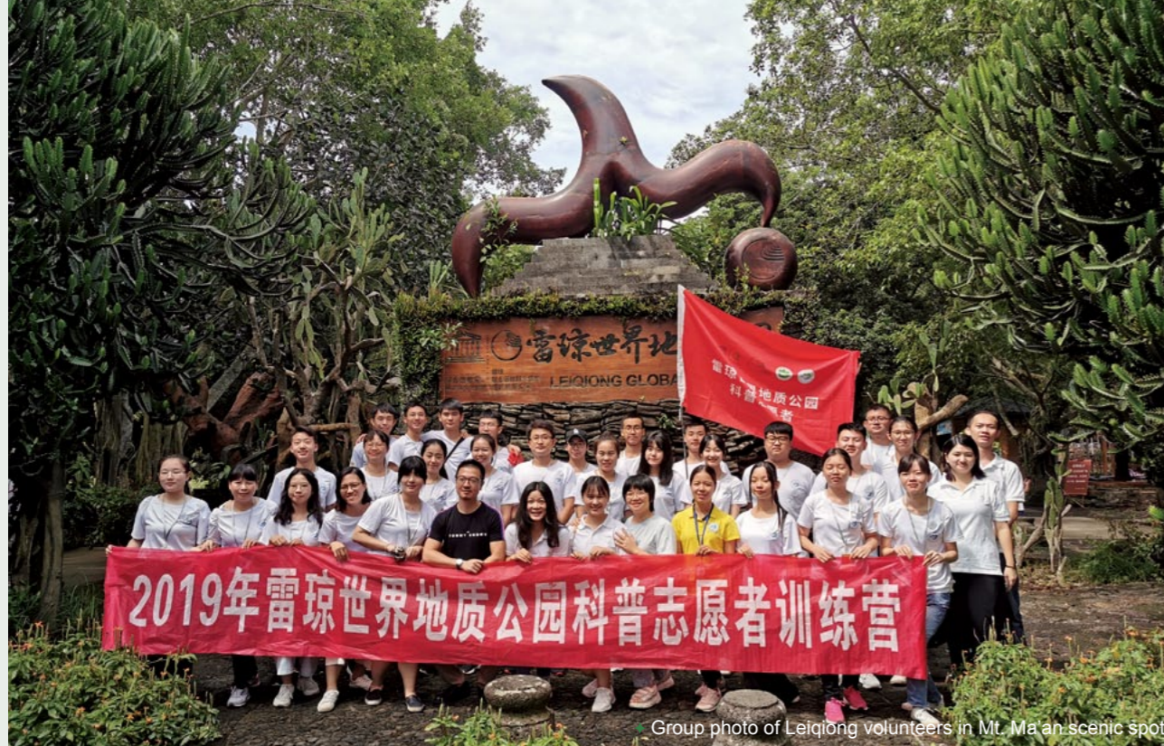
Group photo of Leiqiong volunteers in Mt. Ma'an scenic spot