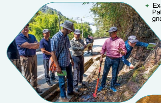
Examining the Paleozoic(~430Ma) gneissic granite

granite and effectively advanced the construction and development of Longyan Aspiring Global Geopark.