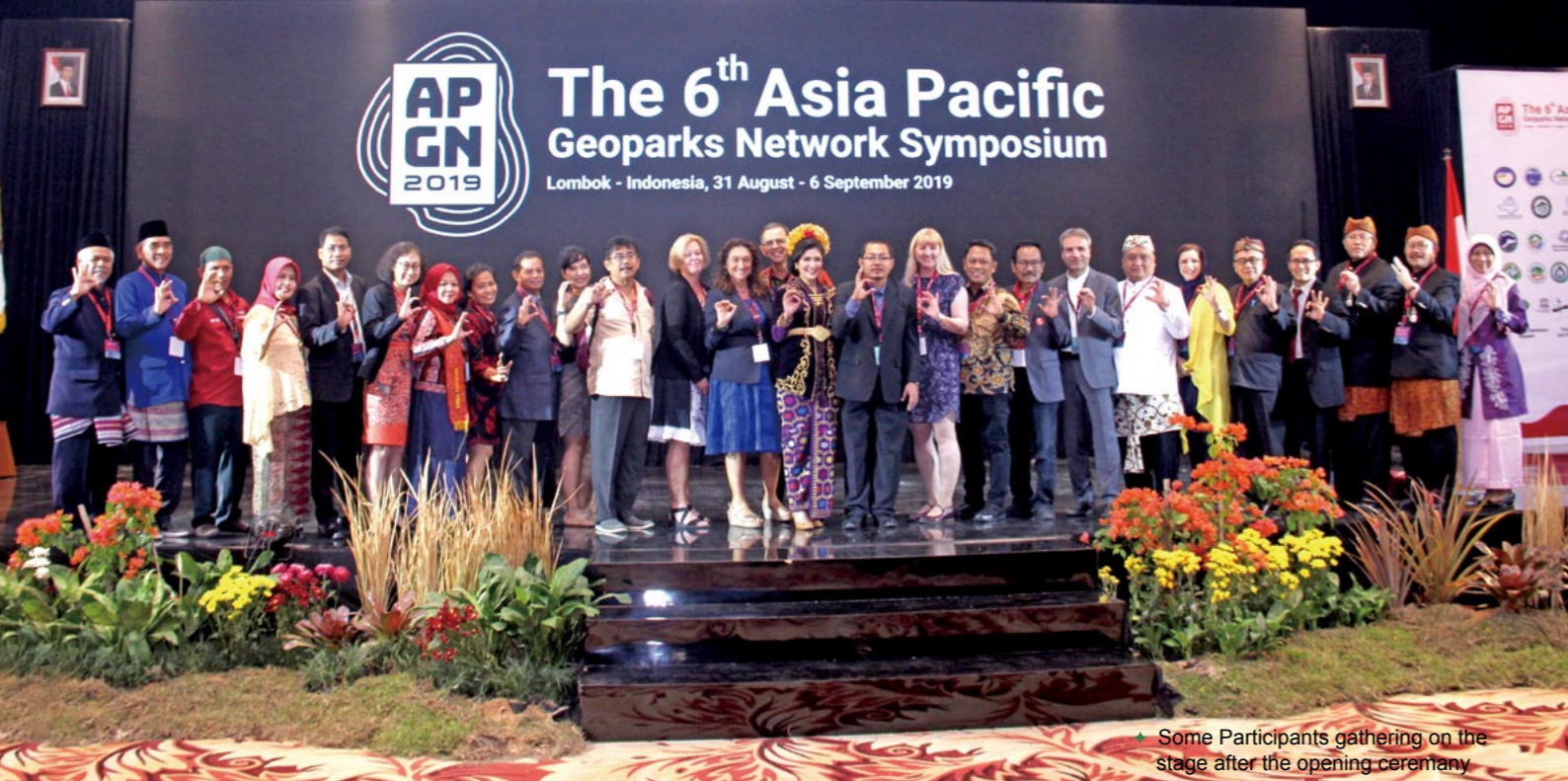
Some Participants gathering on the stage after the opening ceremony