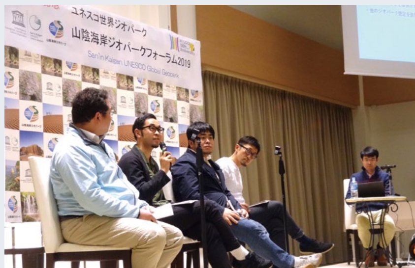
◆ Panel Discussion

San'in Kaigan UNESCO Global Geopark, Japan saninkaigangeopark@pref.hyogo.lg.jp