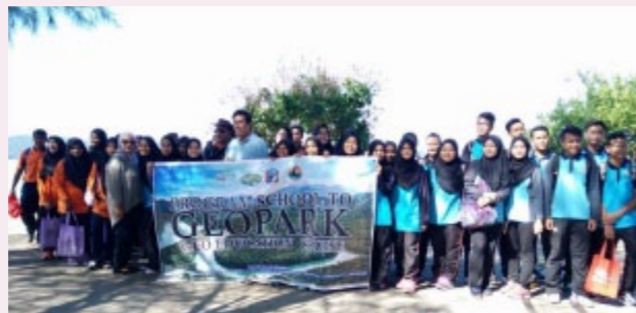
♦ A number of activities held as part of the "School to Geopark" programme by Langkawi Authority Development (LADA).