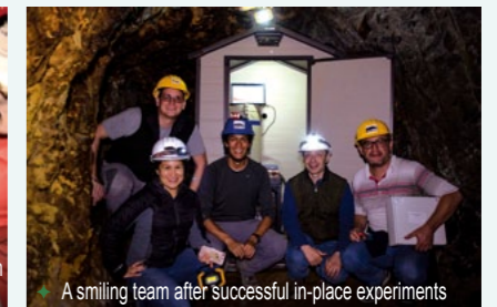
A smiling team after successful in-place experiments