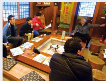
◆ Exchange with Mayor of Itashino Local Area