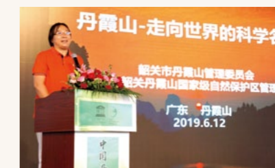
◆ The representative of Danxiashan made a special report on the construction of the famous mountain of Danxiashan

to realize measures regarding science popularization and the