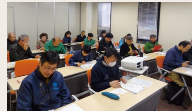
◆ Classroom Lecture

San'in Kaigan Geopark Promotion Council, Japan saninkaigangeopark@pref.hyogo.lg.jp