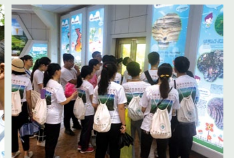
◆ Volunteers visit popularization museums of Mt. Ma'an scenic spot.