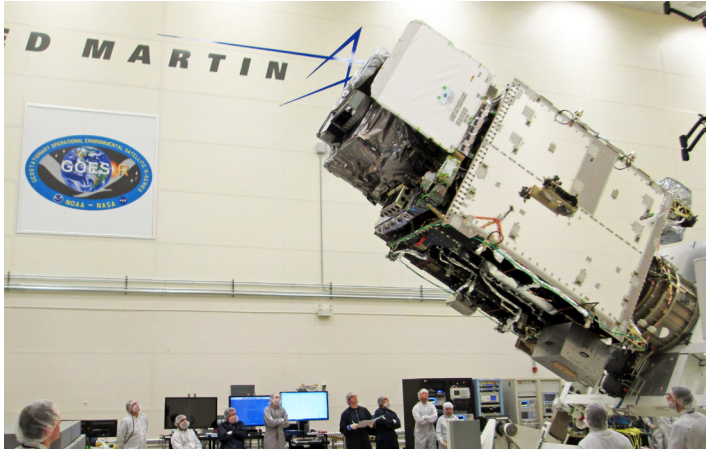
The GOES-R spacecraft is rotated to the horizontal position in a cleanroom at Lockheed Martin in Littleton, Colorado.

Additional GOES-R spacecraft integration activities were underway this quarter. In November, the GLM electronics unit was powered on for the first time after installation onto the spacecraft and the GOES-R command and telemetry processor completed all testing. In December, the EPP was successfully deployed for the first time, and the SPP and solar array yoke were mated. Lockheed Martin also completed all testing of the GOES-R spacecraft in the vertical orientation and successfully rotated the spacecraft to horizontal.