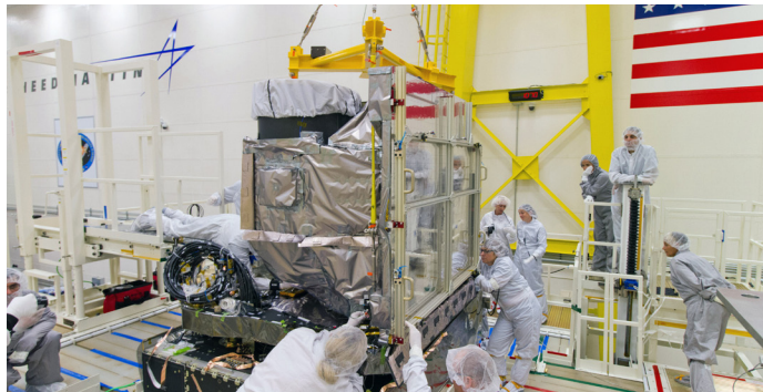
The GOES-R SEISS (upper left), GLM (upper right) and ABI (lower) are installed on the GOES-R spacecraft at Lockheed Martin in Littleton, Colorado.