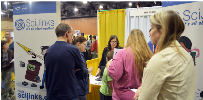
The NOAA SciJinks booth at WeatherFest, which took place prior to the AMS 95th Annual Meeting.

The American Meteorological Society's 95th Annual Meeting was held January 4–8 in Phoenix. The AMS meeting also hosted the 11th Symposium on New Generation Operational Environmental Satellite Systems which highlighted many of the development activities, program science and user-readiness preparations underway in the GOES-R Series Program. GOES-R presentations and posters from the conference are available on the GOES-R website . The GOES-R Series Program also participated in WeatherFest, staffing the NOAA SciJinks booth and providing information about forecasting, satellite meteorology and Earth science. WeatherFest is an annual weather fair attended by weather enthusiasts of all ages.