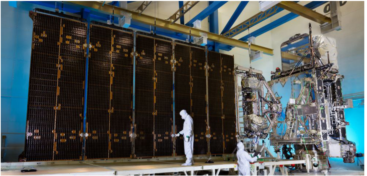
GOES-R spacecraft with solar wing installed.

Harris Corporation has delivered all hardware and completed installation and integration of the GOES-R ground segment IT infrastructure supporting operational systems at NOAA Satellite Operations Facility (NSOF) in Suitland, Maryland, Wallops Command and Data Acquisition Station (WCDAS) in Wallops, Virginia, and the Consolidated Backup (CBU) in Fairmont, West Virginia. The system includes 2,100 servers and storage services totaling three petabytes. Harris issued a press release on February 25 to mark this achievement.