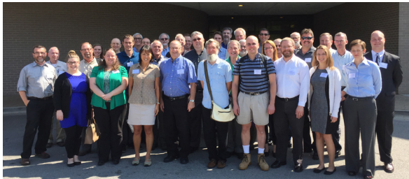
GLM Science Team Meeting attendees.

program and instrument status, vendor and Calibration Working Group post-launch test and post-launch product test tools, validation reference data, field campaign plans, pre-launch validation studies, Proving Ground demonstrations and forecaster training.