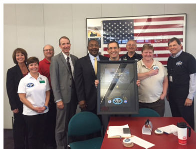
The ABI development team was honored with a plaque commemorating the completion of all GOES-R series ABI instruments.

was successfully completed on August 31 at Harris Corporation in Fort Wayne, Indiana. The review confirmed the GOES-U ABI design has been fully qualified and will support the GOES-U mission needs. The instrument will be held in storage until integration activities begin for GOES-U. This is the fourth and final ABI instrument in the GOES-R series to complete development.