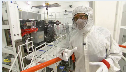
NBC's Al Roker got an exclusive first look at GOES-R.