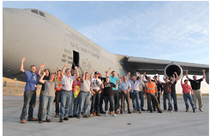
Team members celebrate the arrival of the GOES-R spacecraft at Kennedy Space Center.

On August 22, the GOES-R satellite traveled from Buckley Air Force Base in Aurora, Colorado, to Kennedy Space Center (KSC) in Cape Canaveral, Florida, on board a C-5M Super Galaxy Transport Aircraft. After arrival at KSC, GOES-R was brought to a clean room at Astrotech Space Operations in Titusville, Florida, where it was unpacked and began final testing and preparation for encapsulation on top of the rocket that will carry it to geostationary orbit. On August 23, NASA Goddard issued a news release on the arrival and NOAA issued a photo story on August 23. Additional photos are available on the GOES-R website.