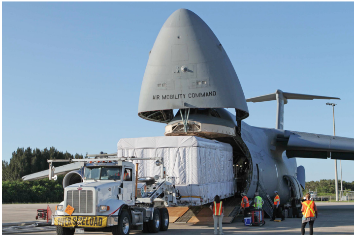
GOES-R emerges from the aircraft at Kennedy Space Center after its journey from Colorado.