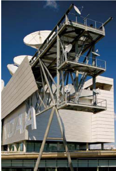
NOAA Satellite Operations Facility

Ground support is critical to the GOES-R mission. NOAA developed a state-of-the-art ground system that receives data from GOES-R Series spacecraft and generates real-time data products. This is accomplished via a core set of functional elements, which include space/ground communications, raw data processing, monitoring satellite health and safety, and commanding the spacecraft and instruments, as well as a new antenna system and a product access component.