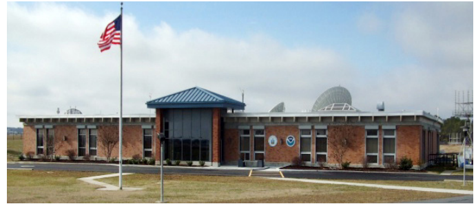
Wallops Command and Data Acquisition Station