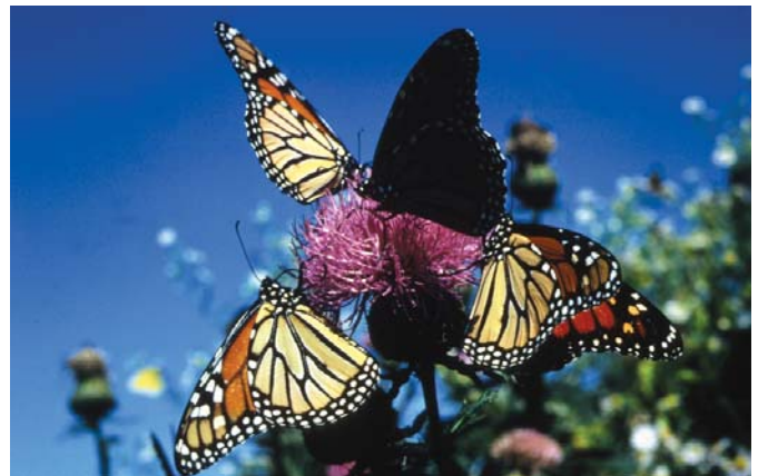
Biodiversity includes all organisms, from bacteria to complex animals.

Strong institutions at all levels are essential to support biodiversity conservation and the sustainable use of ecosystems. International agreements need to include enforcement measures and take into account impacts on biodiversity and possible synergies with other agreements. Most direct actions to halt or reduce biodiversity loss need to be taken at local or national level. Suitable laws and policies developed by central governments can enable local levels of government to provide incentives for sustainable resource management.