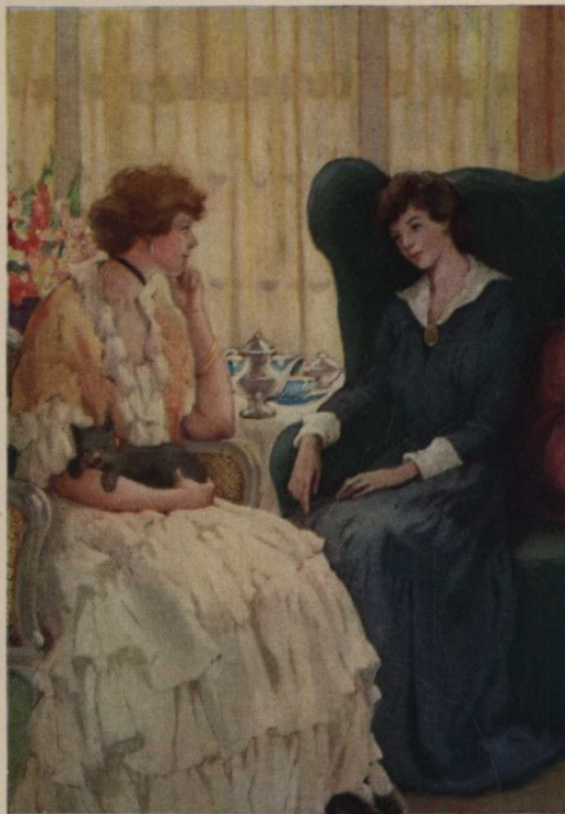
SHE PUT ALEXANDRIA INTO THE MOST COMFORTABLE OF HER CHAIRS AND DREW ANOTHER CLOSE TO IT