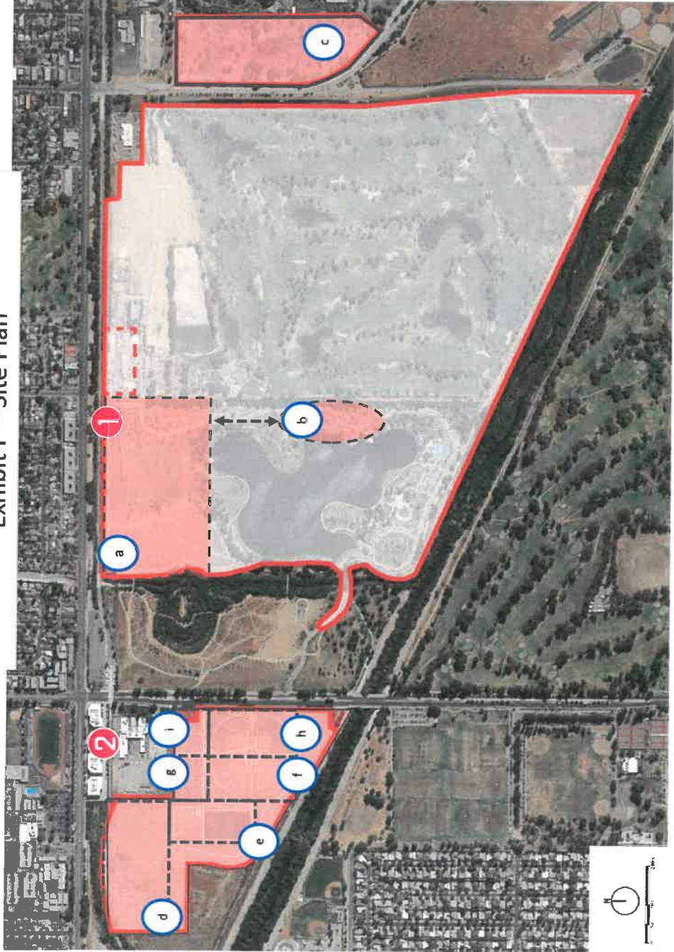
Exhibit F – Site Plan