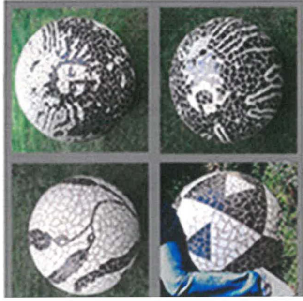
Mosaic Balls - Sculptural Seating