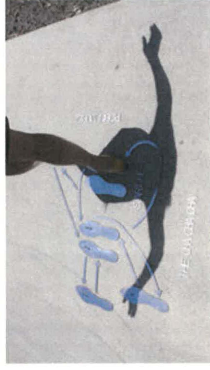
Dance Steps Sculpture on a Walkway