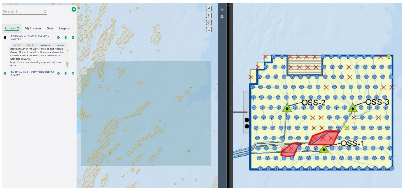
Figure 1: Left panel: Shoal 3 locations as indicated in Pickens and Taylor (2020; see footnote 2) as shown on the MARCO data portal. Right panel: Illustration of Alternative C in the CVOW DEIS, with areas identified as sand ridge habitat indicated in red polygons.

and the overall lease area. Based on this data set, there are many sand ridges outside of the exclusion areas identified in Alternative C, including within the export cable corridors. Even under Alternative C, these additional sand ridges will be affected by placement of turbine foundations, site preparation, and trenching for interarray and export cables. Our understanding is that when installing cables in areas with larger sand bedforms (waves or shoals), the bedforms are first removed, and then trenching occurs below this baseline depth. These activities will have substantial impacts on sand ridges occurring throughout the project area.