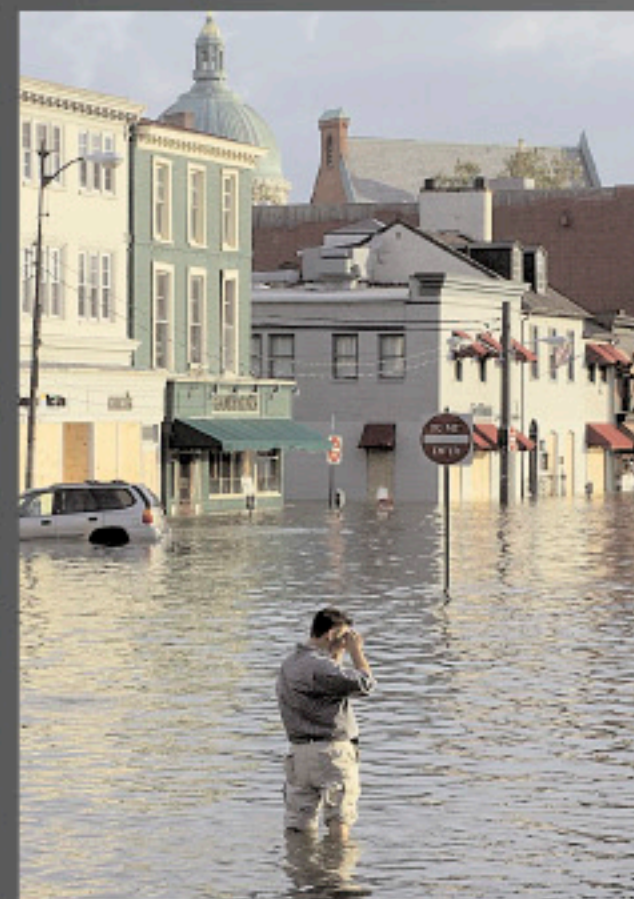
Main and Randall Streets

If Isabel left devastation in its wake, the storm also taught us valuable lessons about how to prepare for these events—and where and how to build along the coast. In addition, Hurricane Isabel reminded us that our rapidly changing shores and waters demand that we act now to be ready for what risks the future might bring.