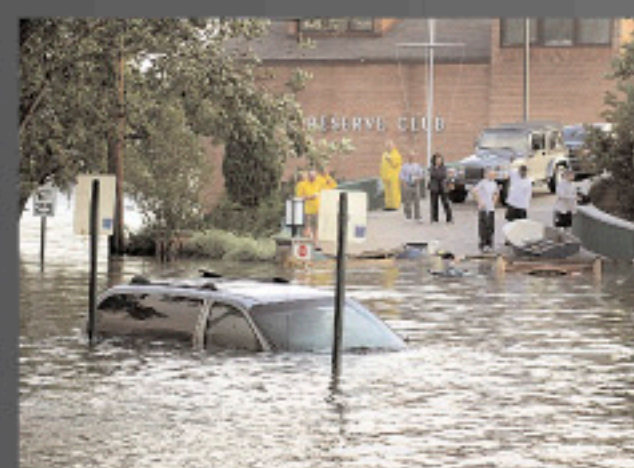
Annapolis Marriott, Compromise Street