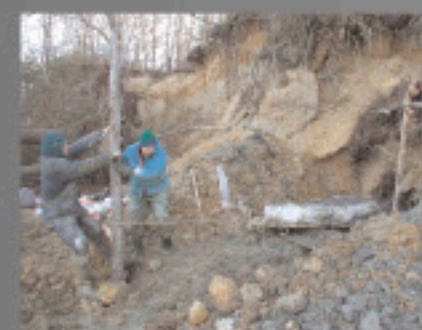
Paleontologists quarrying fossil whale skull wrapped in a field jacket, or cast

"HURRICANES ARE WHAT FOSSIL HUNTERS WAIT FOR. The day after Isabel, we decided to go to a favorite spot on the St. Mary's River. When we got there the beach was completely changed. There was so much accumulated sediment that when we landed the boat on the beach and stepped out, we were instantly up to our knees where usually it's hard-packed sand. And the place was covered with unusual seashells. The downed pine trees had been completely swept off the beach and along with those came