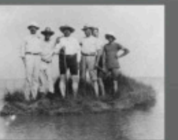
Local fishing club stages a reunion on last remnant of Sharps Island, c. 1950.

Experts continue to develop erosion management methods to better protect homes, roads and other structures, as well as sensitive coastal ecosystems and the people who live there. While putting these programs into practice may be expensive, doing nothing will ultimately cost much more.