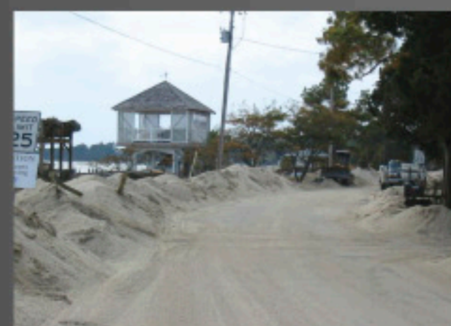
Sand washed up by waves, Piney Point