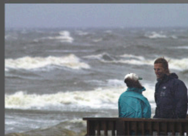
Waves before the storm, Long Beach