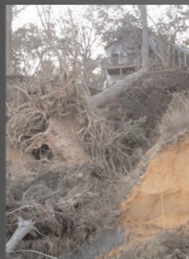
House on the edge, Calvert Cliffs

If Isabel left devastation in its wake, the storm also taught us valuable lessons about how to prepare for these events—and where and how to build along the coast. In addition, Hurricane Isabel reminded us that our rapidly changing shores and waters demand that we act now to be ready for what risks the future might bring.